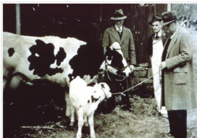
The first calf born via artificial insemination in the U.S. in February 1939 was at the Schomp Farm in Stanton, NJ. At the time it was considered the most photographed and publicized bovine in history.

Rutgers tagline, "Jersey Roots, Global Reach," aptly describes the impact of agricultural innovations at the university. The development of new methods, equipment and plant varieties coming from Rutgers NJ Agricultural Experiment Station (NJAES) has been robust. Few may realize that some of the ag products and technologies in use worldwide today were developed at Rutgers NJAES. Even less well known is the fact that while university agricultural researchers toiled in their labs or research fields on their developments, NJ farmers were working closely with the scientists to test these advances on their own farms, providing essential data to the researchers. These growers took the financial risks to test these innovations on the good faith that they would lead to improvements in their commercial production. Some of these farmer-university connections developed into more than just on-farm trials; they became enduring relationships.