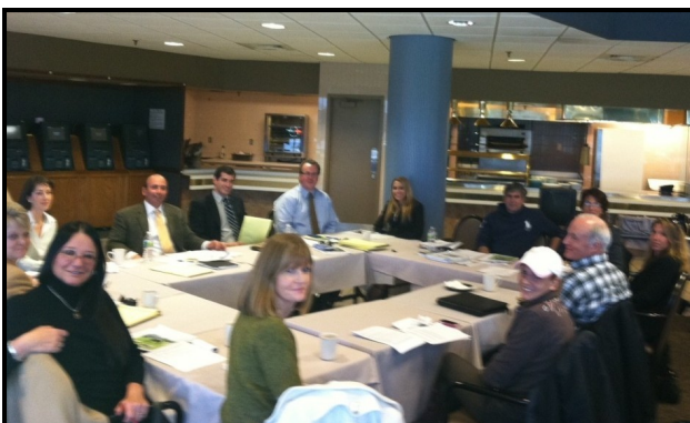
Left - Open Space Pace Committee meets at Freehold Raceway Renaissance Room members include industry, extension, vets, equine community, etc.