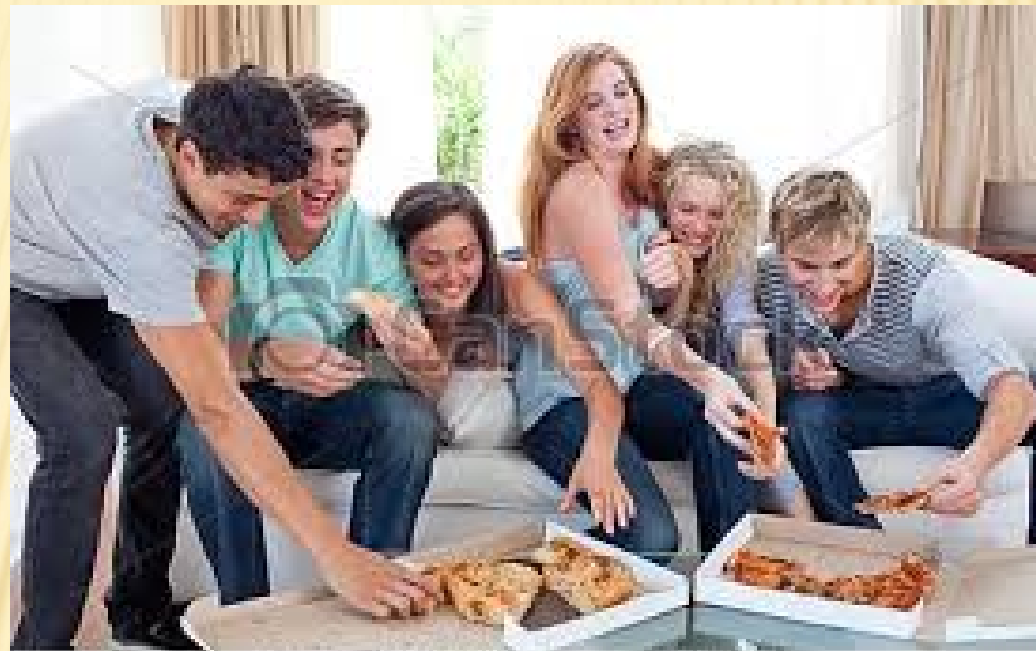
© Can Stock Photo - csp2793969