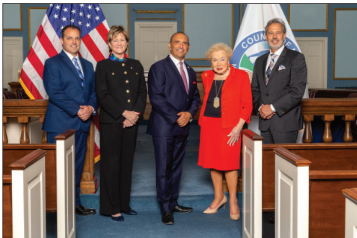
2022 Monmouth County Board of County Commissioners

Have a safe and happy summer! From, The Monmouth County Board of County Commissioners.