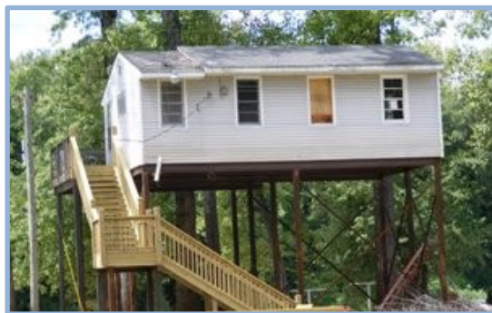
An Elevated Cabin in Jersey County, Illinois

Using the GIS mapping data, relocation, elevation techniques—and prompted by the CRS—the County has made great progress on reducing its exposure to repetitive flood losses. “We have been able to reduce the number of repetitive loss structures to 29—a huge improvement,” says Cregmiles. “And we have mitigated every one of our severe repetitive loss properties.” The at-risk cabins on Corps property likewise have been minimized: after removing 71 of them and elevating 58, only 90 of those remain.