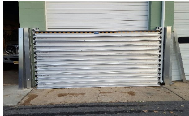
Community Action #42_4: HMGP-funded flood-proofed doors at Rumson's DPW building, which experienced 4 feet of water during Superstorm Sandy.