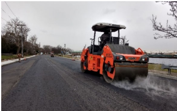
Community Action # 30-16: Road Elevation in Manasquan, NJ.