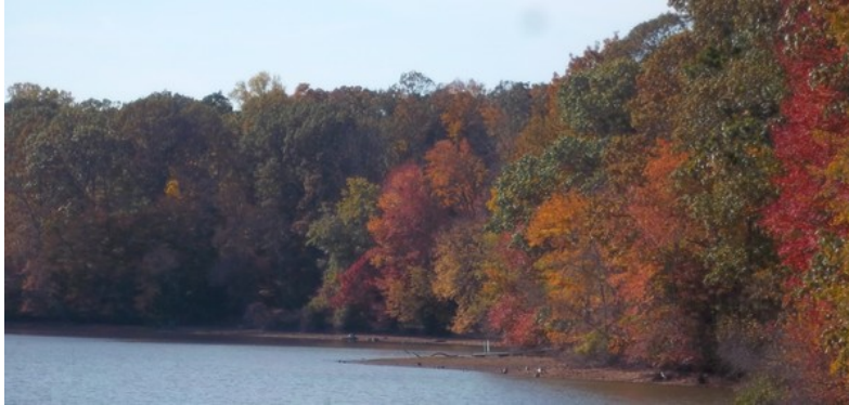
Swimming River Reservoir, Lincroft.

Monmouth County, NJ sent this bulletin at 10/05/2020 11:45 AM EDT