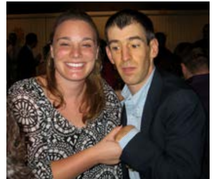
Participants & Monmouth County Park System staff enjoy the annual semi-formal with a little help from the Friends of the Parks.