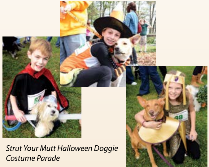
Strut Your Mutt Halloween Doggie Costume Parade

Special events are also critical to our financial health. This is a fun way to be involved and assist in paying for projects and programs. We raised crucial funds at the Strut Your Mutt Halloween Doggie Costume Parade, our annual golf outing, and a brand new Flavour Tasting event at the Molly Pitcher Inn. Raffle ticket sales at the Monmouth County Fair are another way we raise revenue. Just look at how much fun everyone is having at our events! Hopefully, you can join us next time! $48,121