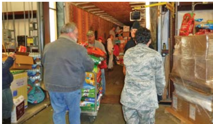
(Top) One of many tractor trailers arriving loaded with supplies.

The Park System's Trails Maintenance Team helps maintain over 125 miles of trails each year. These volunteers are specially trained and must be certified to perform this task. It is our pleasure to provide a luncheon on National Trails Day as our way of showing our appreciation of their efforts. $2,283