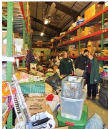
(Right) Monmouth County Park System staff receive donations from around the country in the Park System's Central Supply warehouse.