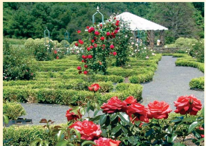
Deep Cut Gardens Rose Garden & Parterre

The Monmouth County Park System volunteers are precious to the Friends – thank you!