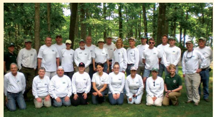
National Trails Day Volunteers & Staff