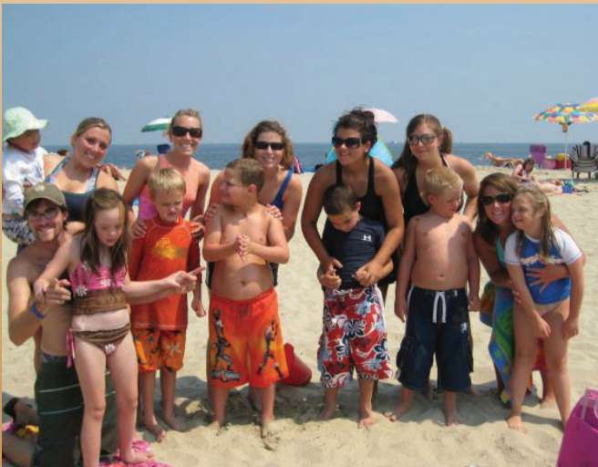
Therapeutic Recreation Beach Outing at Seven Presidents Oceanfront Park