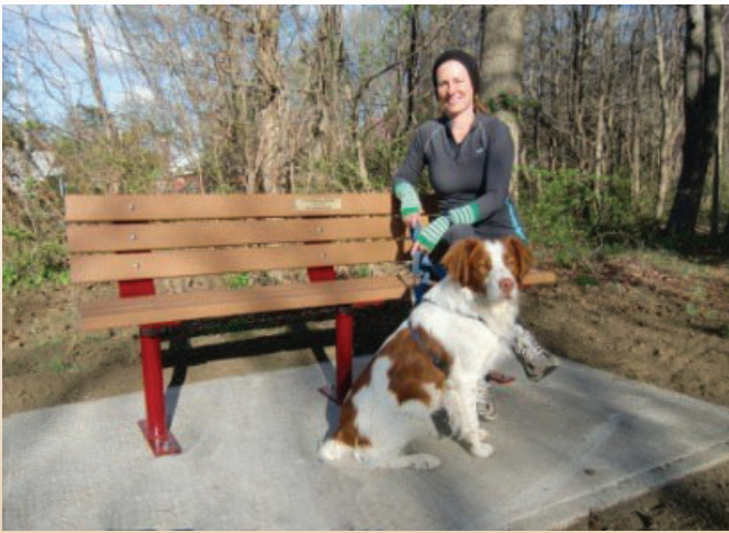
Station Road Bench on Henry Hudson Trail