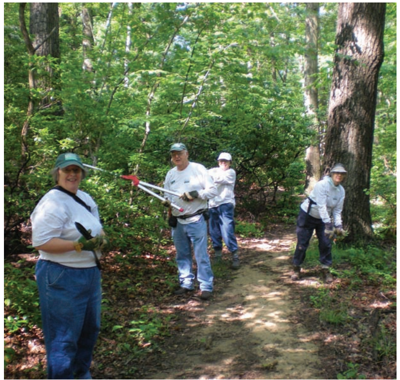
Trails team hard at work.