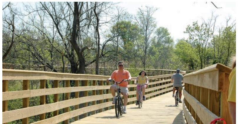
Thompson Park Bridge Dedication

Thompson Park proudly unveiled two new trail bridges on April 21st. These bridges provided the missing pieces to the Thompson Park trail. They are a pleasure for all to enjoy! These projects were a joint collaboration between the Monmouth County Park System and Monmouth County's Division of Engineering. The Friends of the Parks were proud to provide refreshments for this special event.