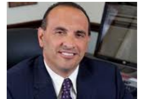
MONMOUTH COUNTY FREEHOLDER DEPUTY DIRECTOR