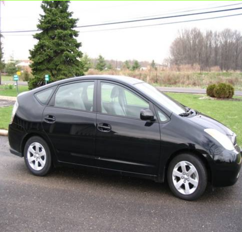
6 Toyota Prius Sedans