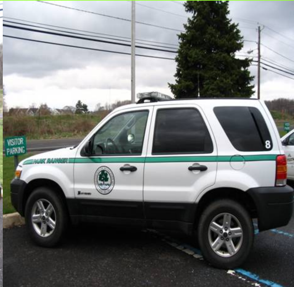
22 Ford Ranger Escapes