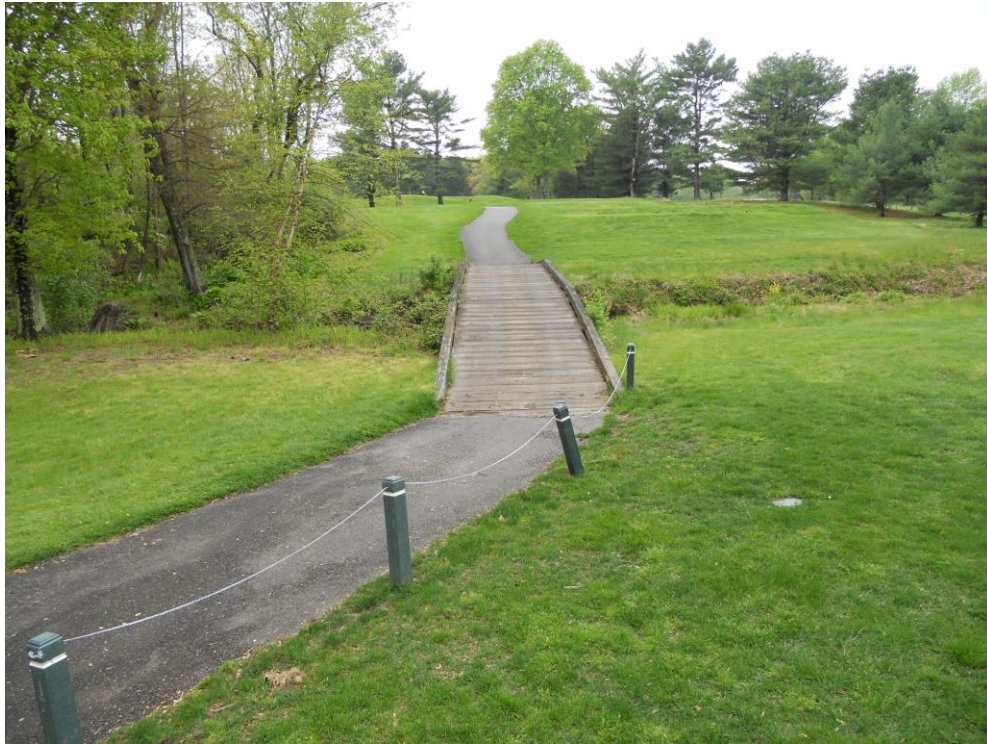
Existing Condition - Howell Park Golf Course -8 th Fairway Bridge –Viewed West