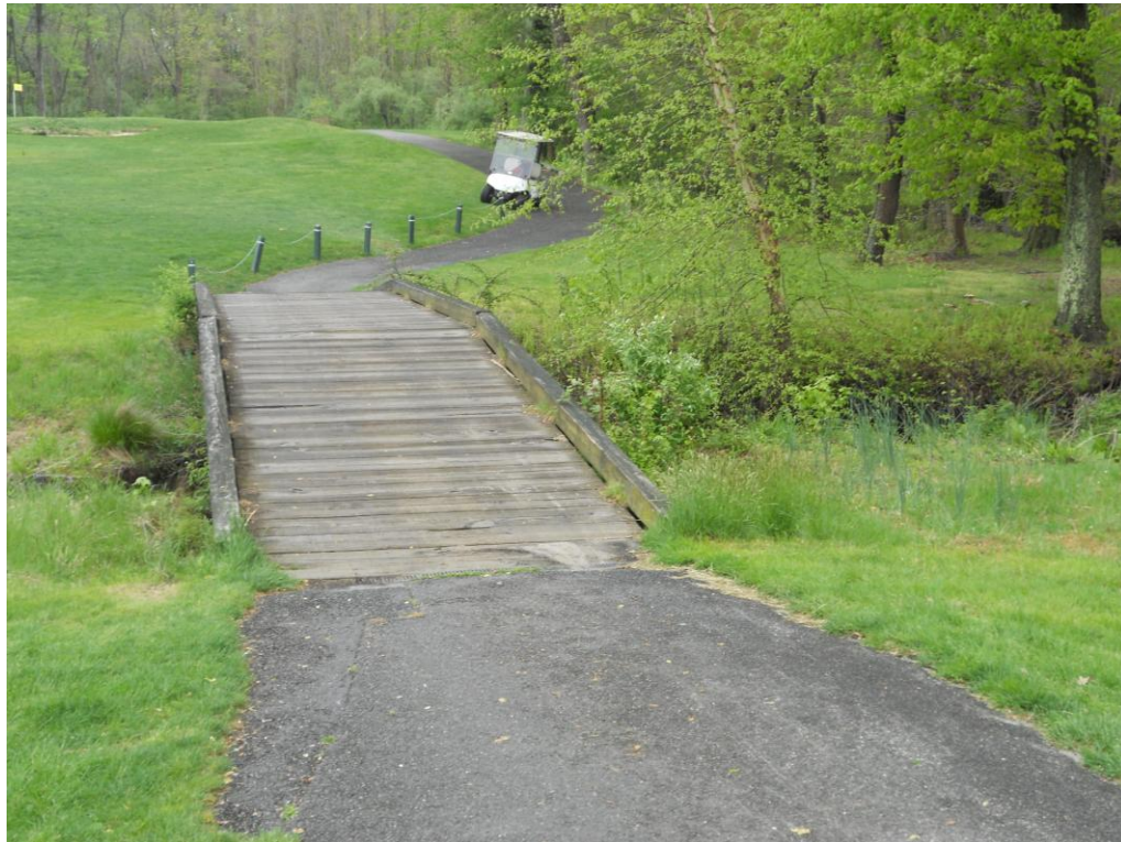
Existing Condition - Howell Park Golf Course -8 th Fairway Bridge –Viewed East