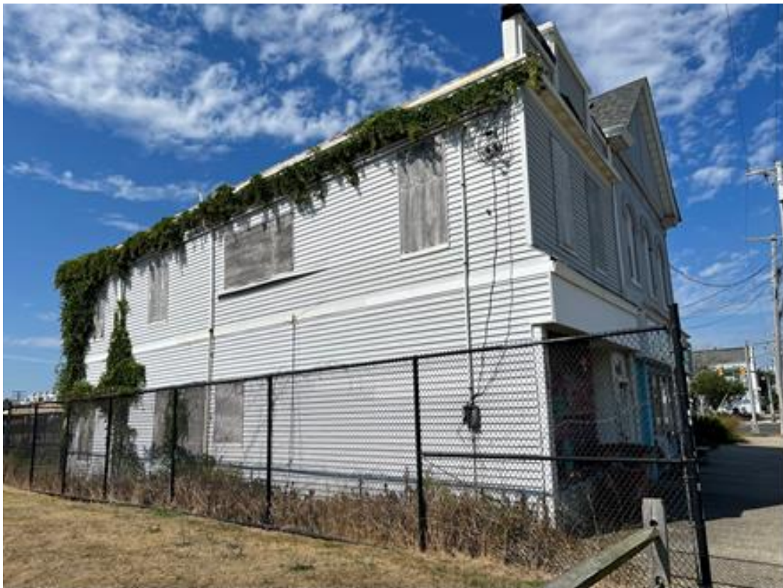
East elevation of Building #1215.