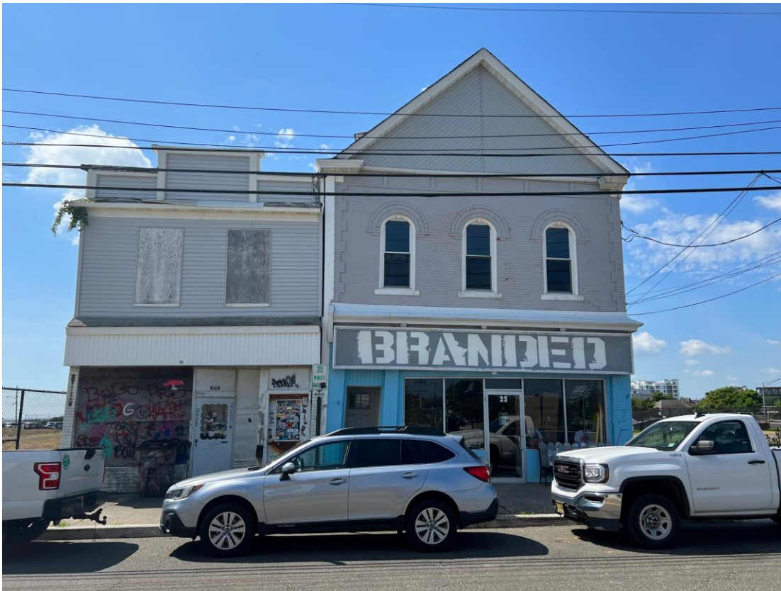
View South from Atlantic Avenue. Building #1215 is on left. MCPS Photo 2022.