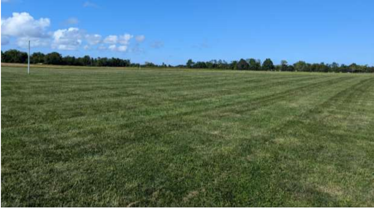
View looking North from the edge of the infield (September 2024)