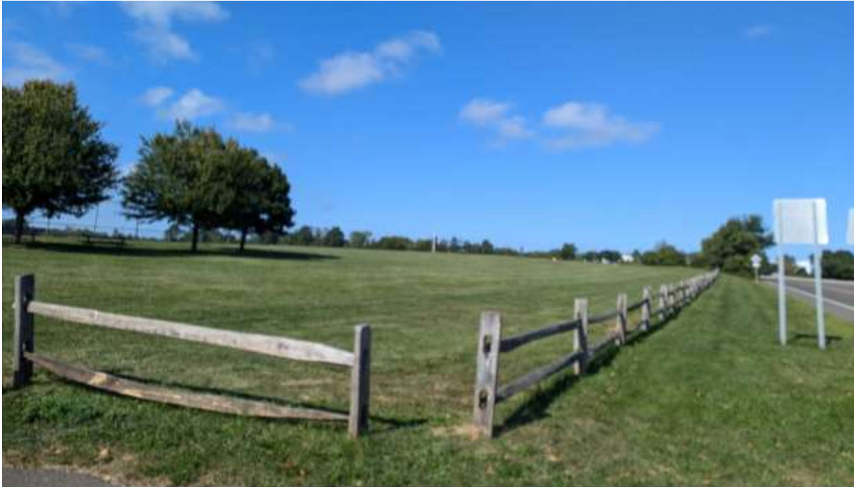
View looking North-Northeast from corner of Woodbine Way and Crescent Place (September 2024)