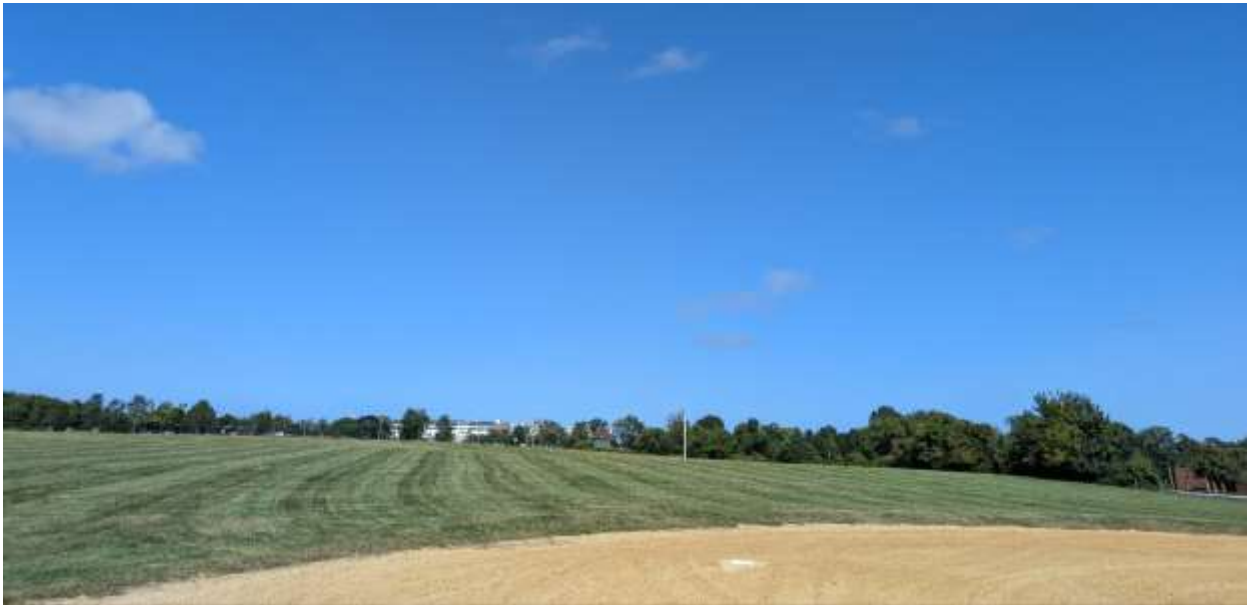
View looking northeast from the third base line (September 2024)