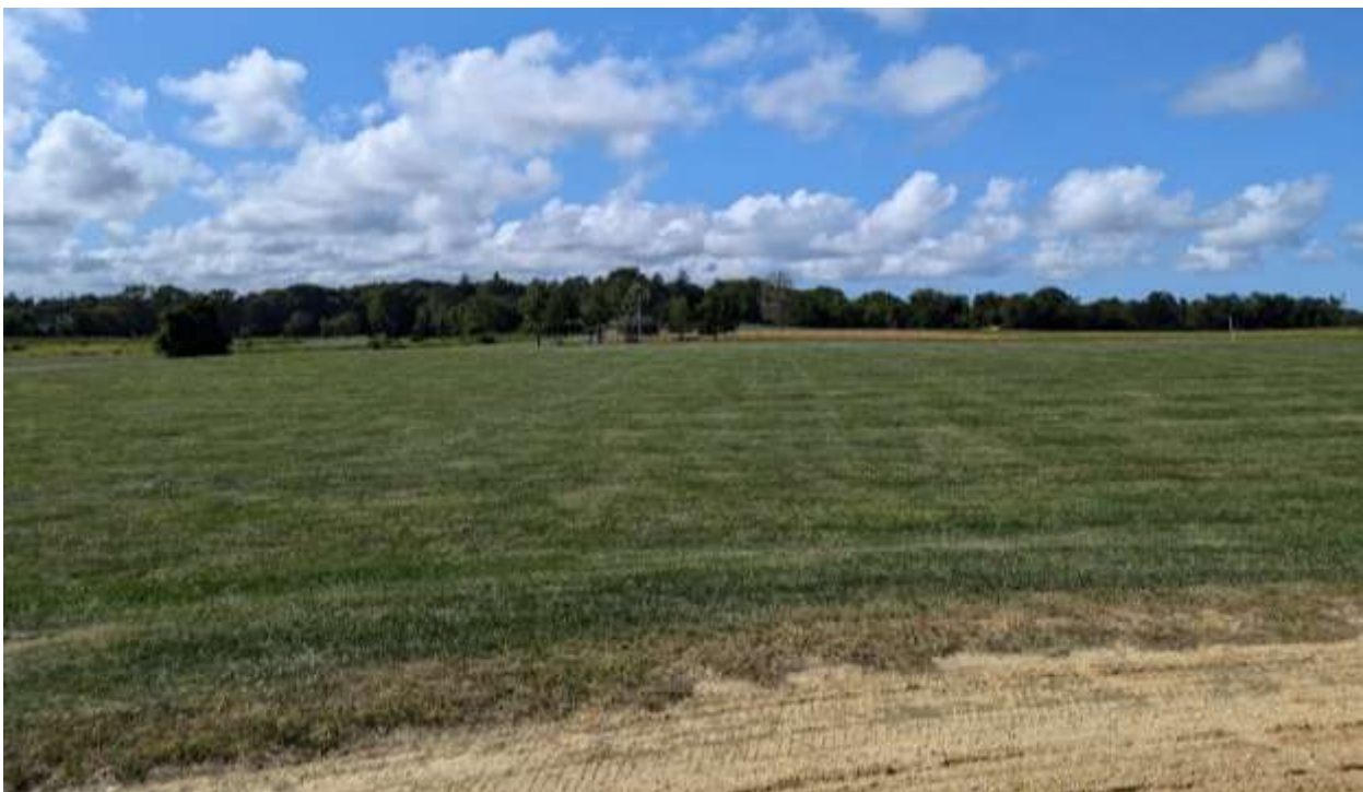
View looking Northwest from the edge of the baseball infield, Woodbine Way shown to the far-left (September 2024)