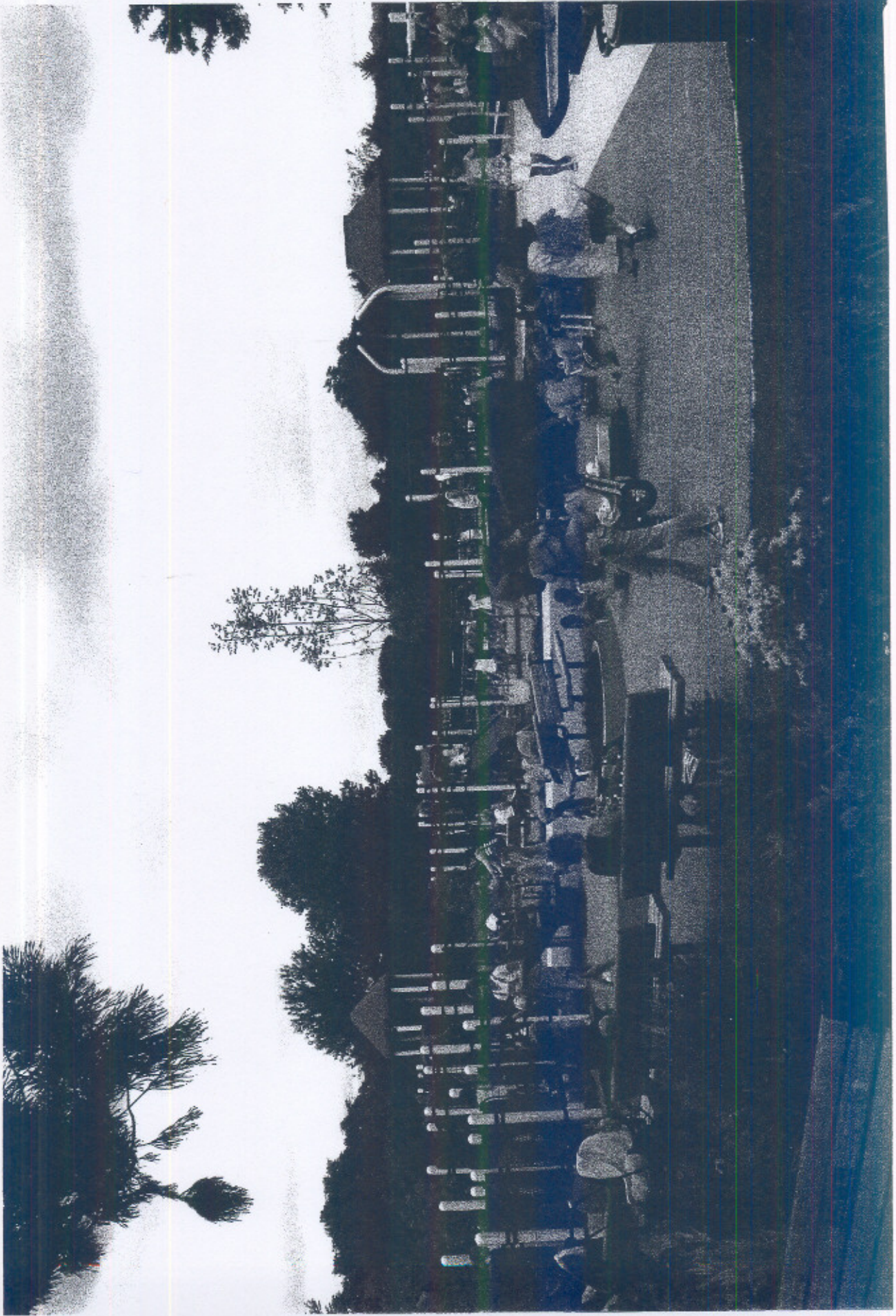
Challenger Place Playground