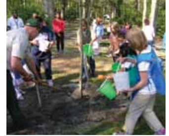
The children give the tree its first dose of water.