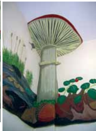
That's a wood mushroom in the corner, with a common black ground beetle.