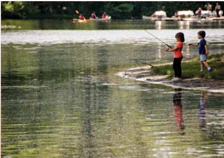
Children enjoy the fishing derby at Outdoor Expo this past spring.