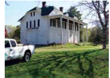
A close-up of the house.