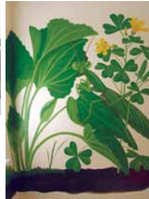
A Praying Mantis amidst a tuft of Wood Sorrel.