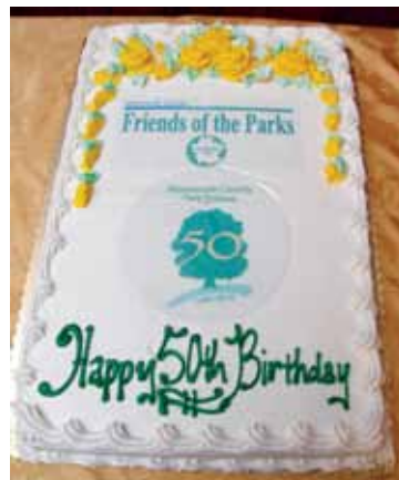
Last but not least, visitors enjoyed one of two birthday cakes and a keepsake anniversary wine glass.