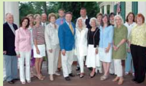
The Park System relies on support from organizations such as the Friends of the Parks.

We can also be proud that Monmouth County established the first County Open Space Trust in our state, and that we are the first public park and recreation agency to be accredited in the nation.