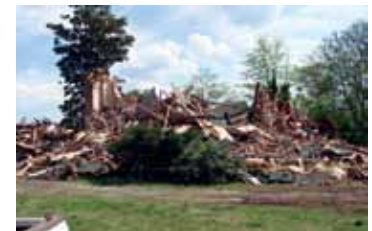
A pile of rubble.