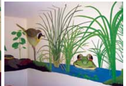
(l to r) The Garter Snake, a Common Yellowthroat Warbler and a Green Frog peeking out of the water.