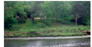
View from bridge (after demolition).