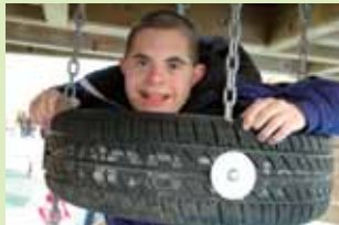
The Park System opened two barrier-free, universal access playgrounds in the last decade at Dorbrook in 2004 and Seven Presidents in 2009.

During 2006, county voters approved changing the Open Space Trust from a fixed amount of $16 million to a rate of 1.5 cents for each $100 dollars of assessed valuation. The program "Creatures of the Night" at Huber Woods celebrated its 10th Anniversary, and much to our chagrin, a fire destroyed the restored Thompson Park Visitor Center.