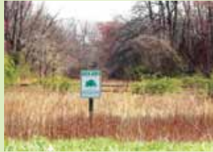
The Yellow Brook Tract is an undeveloped piece of property off of Rt. 33 in Howell.

Our fifth decade began with the purchase of land for the Metedeconk River Greenway, preservation of the Yellow Brook Tract, and opening of the Manasquan Reservoir Environmental Center.