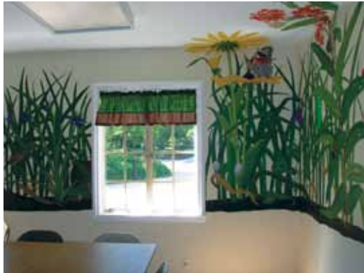
The yellow flower is a Black-eyed Susan, the orange-red one on the right is Butterfly Weed. There is a monarch caterpillar and chrysalis in the leaves.