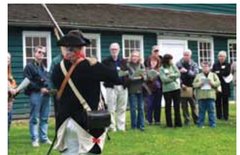
The onlookers are from historical societies and sites interested in presenting living history programs, as well as members of the New Jersey Living History Advisory Council.

KA-BOOM! Normally one of our quieter sites, Historic Walnford hosted a noisier-than-normal workshop this past spring, entitled “Presenting the Past,” sponsored by the NJ Living History Council (NJLHC). During that event, attendees saw a demonstration on black powder safety procedures for living history programs.