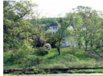
The Fischer-Stern house, before demolition; view from Locust Point Bridge.

Demolition of the old house and construction of a new parking lot were well underway at the Claypit Creek section of Hartshorne Woods Park this past spring. This project is particularly important since Claypit Creek offers some beautiful views of the Navesink River in this part of Middletown.