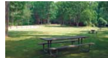
The area is now a parking lot.