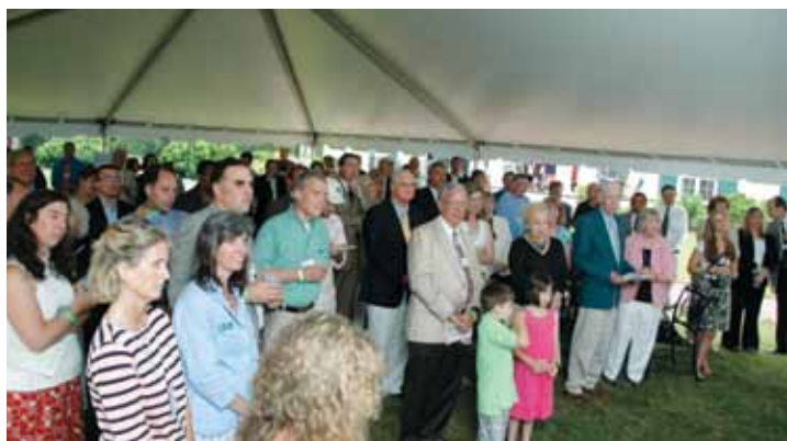
The crowd gathered under the main tent out front to hear opening remarks.