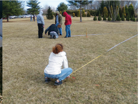
Students doing mark-out

FFA students learn about building a golf course through interpreting architectural designs, calculating measurements and doing mark-outs, rough shaping the features of the hole, installing drainage, irrigation and bunkers; and selecting the proper soil mix and grass types for building a golf hole.