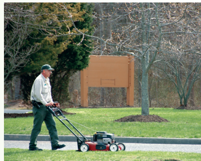
Ranger Ivan Gottstein of the Manasquan Reservoir mows the grassy strips around the Visitor Center entrance and lots. As part of our green effort, park staff are encouraged to explore places where it may be possible to convert mow areas to low mow or no mow areas.