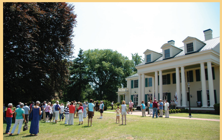
Ta Da!!! The finished VC, as of last July at the Open House. In spite of all the modern upgrades, it is very hard to tell the difference between the old building and new, even for staff who work there every day!