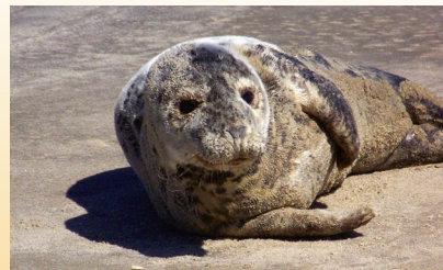
Here she is resting after her journey