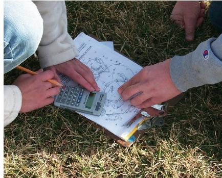
Students doing calculations

One of this program's key components is a living, outdoor classroom in the form of a real golf hole that students help build and maintain. Students are now assisting