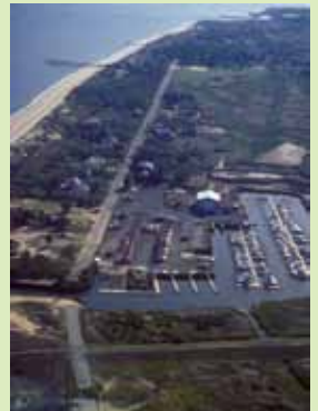
Aerial view of coastal areas that would eventually become Bayshore Waterfront Park, and Monmouth Cove Marina.