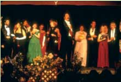
Believe it or not, the park's first musicals were operas.