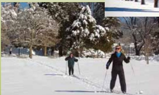
Cross-country ski rentals soared at Thompson Park as people took to the fields.