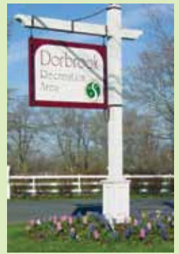
First land for Dorbrook acquired in 1985.

“However beautiful the strategy, you should occasionally look at the results.” --Winston Churchill