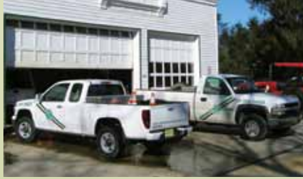
Check out one of our smaller, more energy-efficient trucks (front).