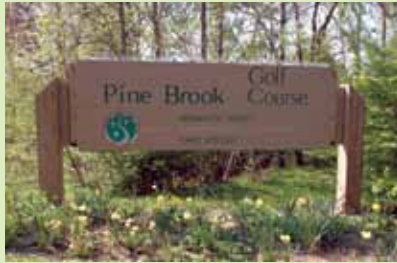
Pine Brook was donated to the Park System in 1981.

During the period of 1980 through 1989, the Park System continued to grow and set new milestones.