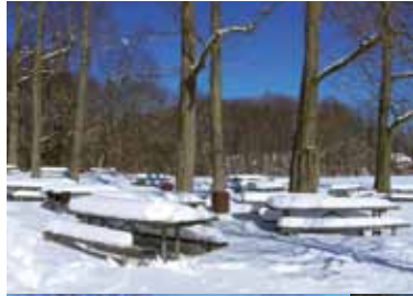
At Holmdel, picnic tables may have been buried in snow...

Here in the parks, staffers were more than busy afterwards clearing the snow (and fallen branches) from the parking lots and roads and trails so that visitors could access the winter wonderland.