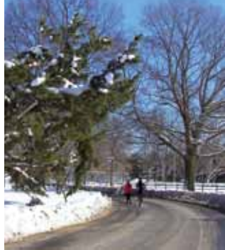
But the paved trail and roads were clear, and ready for use.