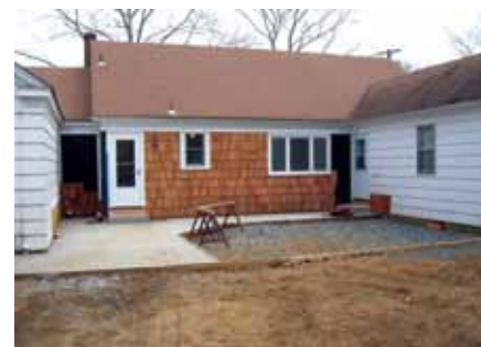
The old wooden front deck (a favorite hang-out for local groundhogs) was replaced with concrete.