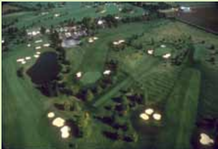
Aerial view of Hominy Hill the year it hosted the USGA Championship, 1983.

The next year, 1982, saw the opening of “Summer Theater in the Barn” at Thompson Park and in 1983, Hominy Hill hosted the USGA Mens’ Amateur Public Links Golf Championship, and the restored Longstreet Farm House opened to the public.