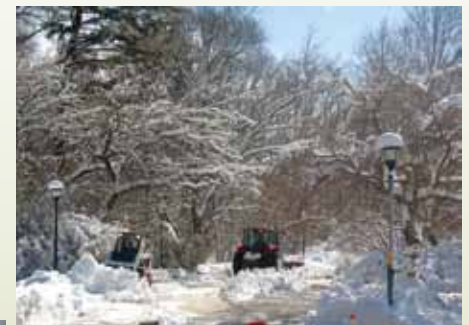
Thompson Rangers dig out the VC lot.

In our area specifically, the first February storms dumped plenty of snow, while the last storm of the month, thankfully, left less snow on the ground (but made for 2 days of miserable driving).