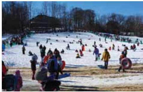
Crowd control is definitely a concern at Holmdel's sledding hill after a big snowfall.

All in all, it was a great winter season for outdoor enthusiasts—skaters, sledders, cross-country skiers, ice fishermen, birders, naturalists and photographers spent plenty of time outside enjoying the parks.