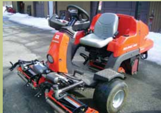
Pine Brook’s new electric mower.