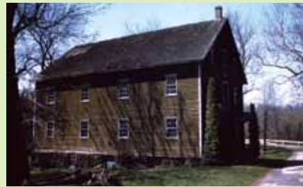
Before it was blue...the mill at Historic Wainford, 1981. (Blue was original color)