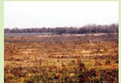
The Manasquan Reservoir, before it was a reservoir.