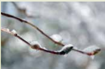
The snowfall made for some picturesque scenery.