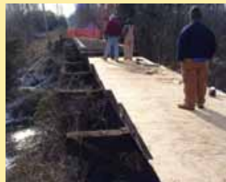
Sections of bridge on the UTT are being replaced.

Henry Hudson Trail, Thorne Creek Bridge: This bridge in the Union Beach section was recently replaced due to wear and tear.