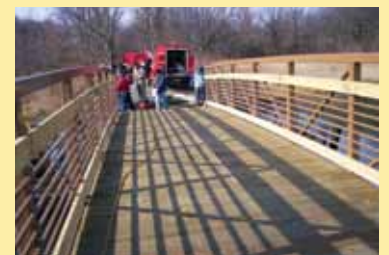
Thorne Creek Bridge.