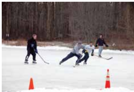
The weather may have been cold but these skaters got into a heated game of ice hockey at Turkey Swamp Park.

All in all, it was a great winter season for outdoor enthusiasts—skaters, sledders, cross-country skiers, ice fishermen, birders, naturalists and photographers spent plenty of time outside enjoying the parks.