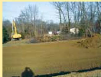
Clearing trees for trail access.

Union Transportation Trail, Phase I: The first mile of the UTT in Upper Freehold is moving along in time for a late spring opening. This trail follows a former railroad right of way, like the Henry Hudson Trail, but will remain unpaved to better match the area's rural scenery.