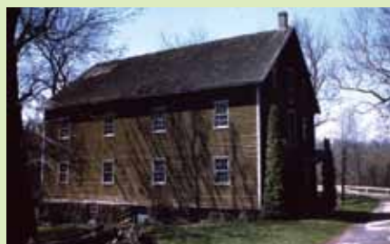
Before it was blue...the mill at Historic Wainford, 1981. (Blue was original color)