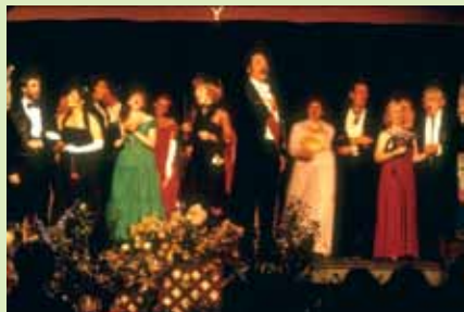
Believe it or not, the park's first musicals were operas.