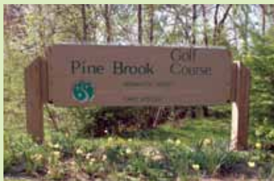
Pine Brook was donated to the Park System in 1981.

During the period of 1980 through 1989, the Park System continued to grow and set new milestones.