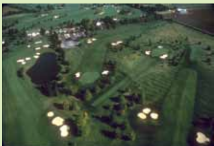
Aerial view of Hominy Hill the year it hosted the USGA Championship, 1983.

The next year, 1982, saw the opening of “Summer Theater in the Barn” at Thompson Park and in 1983, Hominy Hill hosted the USGA Mens’ Amateur Public Links Golf Championship, and the restored Longstreet Farm House opened to the public.