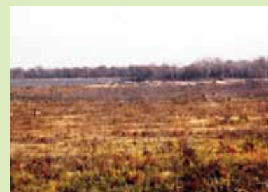
The Manasquan Reservoir, before it was a reservoir.