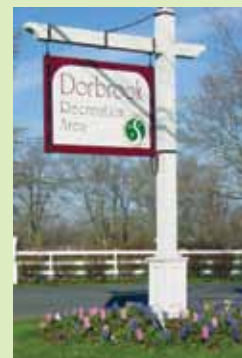
First land for Dorbrook acquired in 1985.

“However beautiful the strategy, you should occasionally look at the results.” --Winston Churchill