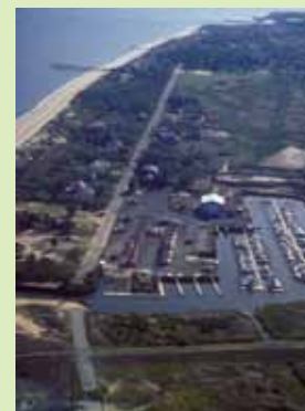
Aerial view of coastal areas that would eventually become Bayshore Waterfront Park, and Monmouth Cove Marina.