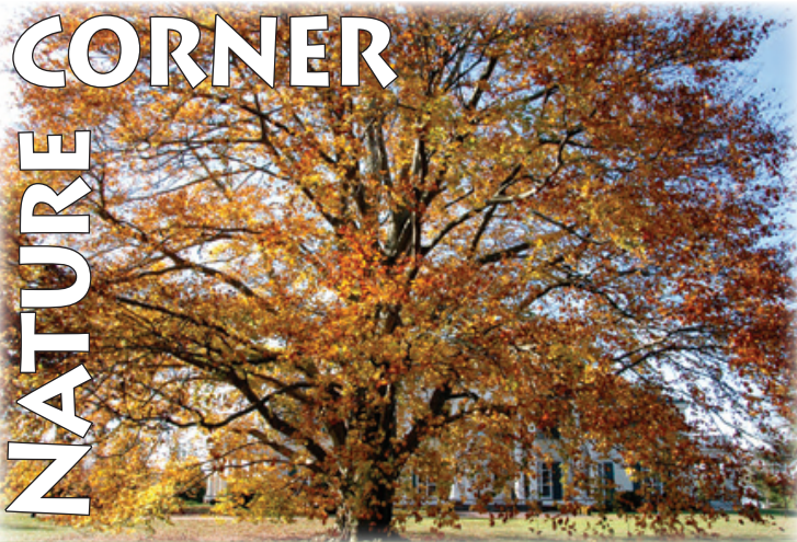
This mid-November photo illustrates how the stately European Copper Beech got its name.