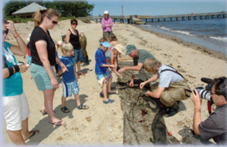
Free seining demos at the newly renovated Bayshore Activity Center help visitors get to know the estuarine life of Raritan Bay.

Beautifully maintained athletic fields are another way that county facilities serve the region—especially when the demand for local ball fields exceeds supply. There are 15 rentable ball fields in 3 different parks that offer extra space for school teams and intramural and community based sports leagues to practice and compete.