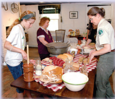
Not just any cooking class... At Historic Walnford's "Bread and Butter," participants prepare bread using historic utensils and ingredients—and churn their own butter in a 200 year old kitchen.