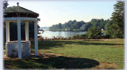
This newly opened site at Claypit Creek in Hartshorne Woods Park is a picturesque site to watch birds, picnic, or walk your dog.