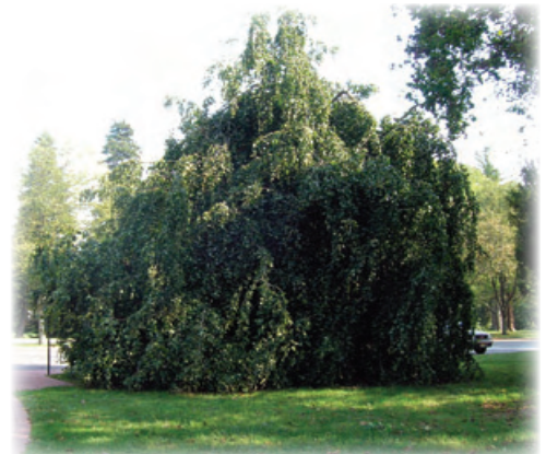
The weeping beech at Thompson Park.

The nuts are more abundant in cycles of 2 or 3 years. The "pulsing" of seed production causes nut-eaters to move away or die out during years of low nut production. This leads to a surplus of nuts the following year which are able to survive and grow into trees. It is said that beechnuts are abundant in years following droughts. It will be interesting to see if that holds true for next year, following the severe drought of 2010.