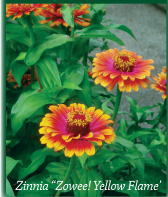
Zinnia 'Zowie! Yellow Flame'

This little hybrid was evaluated by staff and volunteers and found to be an outstanding variety. Attractive deep green, 3" long baby cukes are borne prolifically on the vines. Crisp and tasty, with smaller seeds, less water, and a bitter-free skin, these can be eaten straight from the vine without peeling. Perfect for snacks, canapés or single-serving salads ... if they make it from garden to kitchen! Only 46 days to maturity; suitable for greenhouse growing. Companion planting: Nasturtiums and radishes are said to repel cucumber beetles.