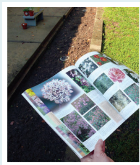
What to Plant Where? The Deep Cut Library can offer much-needed advice when faced with an empty bed to fill.

The above titles are available in the Elvin McDonald Horticultural Library at Deep Cut Gardens in Middletown, open to the public Monday – Saturday, 9:30- 3:30. Borrowing can be arranged through the Friends of the Parks.