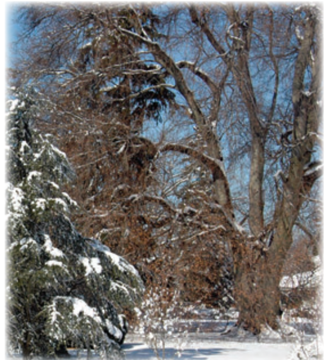
Last year, marcescence was evident on a second, much larger beech at the Thompson Park Visitor Center grounds with its pale gold leaves that cling through even the worse winter storms.

There are many other beautiful beech cultivars. One dramatic example is the European Weeping Beech, which a visitor to Thompson Park may also see nearby. It looks like a gigantic "leafstack" formed by branches which droop downward to touch the ground.