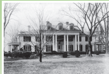
The Visitor Center and beech (just left of the columns) in 1906.

Printed on recycled paper with eco-friendly ink.