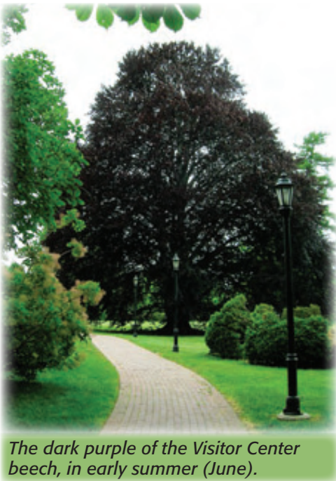
The dark purple of the Visitor Center beech, in early summer (June).

They also sometimes cling to the tree in winter, a characteristic called marcescence . The lovely pale gold or brown leaves later in the year add color to the winter woods. When the leaves do eventually fall, they take a long time to decompose and leave deep piles of leaves on the ground.