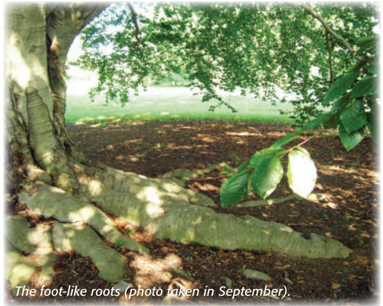
The foot-like roots (photo taken in September).

Another distinguishing characteristic of the tree is its muscular-looking buttress roots which are partially visible above the ground. The tree is mesophytic which means it uses a lot of water, leaving little water for other plants. Not much grows beneath the thirsty beech tree.