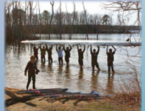
A local crew team practices on the Manasquan Reservoir