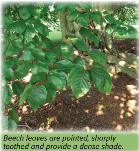
Beech leaves are pointed, sharply toothed and provide a dense shade.