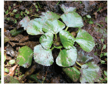
Water chestnut, up close.