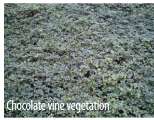
Chocolate vine vegetation

Forests represent a significant component of the Park System landscape (9,000 of 15,000 total acres, or about 60%). The more that park managers and visitors evaluate this resource, the more they develop an appreciation for its great diversity—and the more new invasive species are identified.