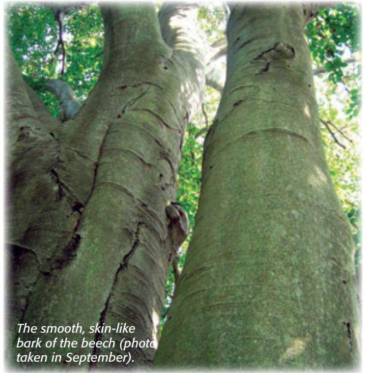
The smooth, skin-like bark of the beech (photo taken in September).

The tree that engendered so much concern is a 95-foot high European Copper Beech ( Fagus sylvatica ). Beech trees attract notice because of several unique characteristics. Their attractive bark is very smooth; it is light grey or even bluish in color. The skin-like bark is so smooth that for thousands of years, it has been irresistible to vandals, love-struck hikers, and note-writers on-the-move who cannot resist the temptation to carve into the thin outer layers. Even Daniel Boone left word to posterity that he had killed a bear in Louisville, Kentucky in 1760.