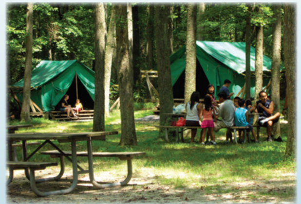
The largest county park at over 2,100 acres, Turkey Swamp Park offers soccer fields, playgrounds, trails, campgrounds, rental boats, picnic shelters and many more recreational opportunities while preserving open space.