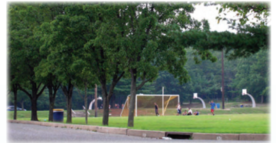
Oak Glen Park in Howell Twp. At 63 acres with baseball fields, soccer fields, basketball courts and other amenities, this is one of the larger local parks.

County park and recreation facilities meet regional priorities. There are sites within 20 minutes driving distance of most county residents—such as Turkey Swamp Park in Freehold—where you can do many different activities.