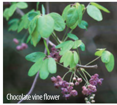
Chocolate vine flower

One such surprise was chocolate vine, Akebia quinata , found recently in the Claypit Creek section of Hartshorne Woods Park. With its soft leaf and attractive purple flowers, it is easy to see why this vine was first brought to this area from Central China. Since then it has silently established itself deep within our forests. This vine can completely cover the forest floor, extend to the understory of newly emerging trees and shrubs, and finally reach into the canopy. A determined and rapid response will be the best strategy to protect this patch of woods, an eradication plan is in place for 2011.