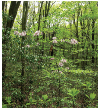
Native azalea in the forest at Hartshorne Woods Park, Middletown

Through the shared goal of protecting New Jersey’s natural resources, CJSST and the Park System worked together on several eradication projects in the summer of 2010. Park Managers identified an infestation of the aggressive invasive vine, Kudzu ( Pueraria monatanana ) in the Rocky Point Section of Hartshorne Woods Park, Middletown. Kudzu has an extensive root system that can grow to 7 inches wide, travel 9 feet into the ground, and weigh 400 pounds—making it virtually impossible to simply dig up!