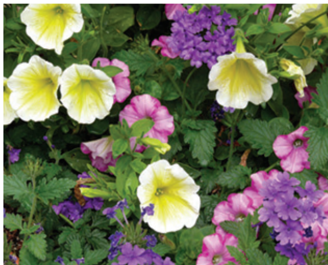
If you don't yet feel ready to prepare your own planting bed, container gardening is a great option for beginners. Classes are available with Deep Cut staff!

The key to choosing the right plant for the location ... patience! (And with perennials, remember: 3 years - sleep, creep, leap). In our library, check out: Right Plant, Right Place , Ferguson (REF 635.9); Perfect Plant, Perfect Place , Lancaster (REF 635.9); and What Plant Where , Lancaster, (REF 635.9).