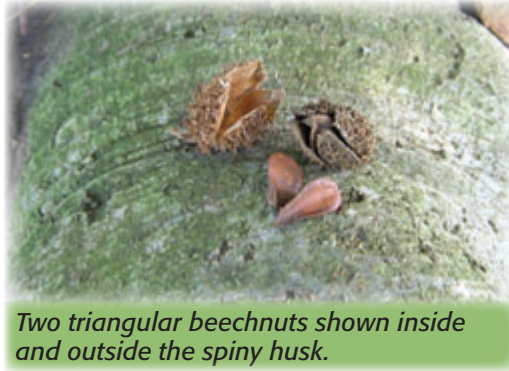
Two triangular beechnuts shown inside and outside the spiny husk.

The nuts of the tree are triangular; usually two of these nuts develop inside a spiny husk or cupule . Along with acorns and hickory nuts, beech nuts provide abundant food for wildlife in our local forests. The nuts are called "mast." A wide variety of animals eat the nutritious beechnuts. These include mammals such as squirrels, chipmunks, opossum, raccoons, white-tail deer, black bears, porcupines, foxes, rabbits, and mice.