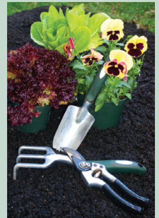
Hand tools (l to r): trowel, cultivator and pruners.