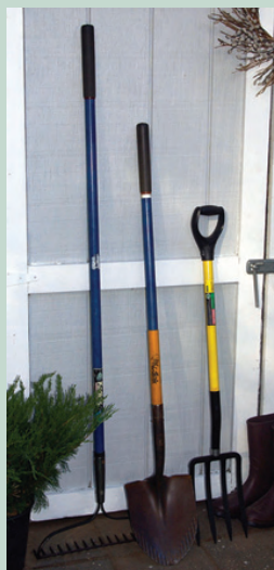
(l to r): Garden Rake, Round-point Shovel, and Garden Fork.