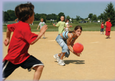
Recreation trends may come and go, but kickball, tennis and in-line skating are still very much alive in the county parks.