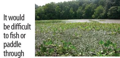
It would be difficult to fish or paddle through this invasive stand of water chestnut, shown overtaking this lake.

One of the newest invasive species to this area, the water chestnut or Trapa natans , was recently identified in Monmouth County though not yet in the parks. This plant has the capacity for explosive growth, and can rapidly infest a lake or pond. One acre of water chestnut can produce enough seeds to cover 100 acres the next year! When considering the size of Park System lakes—the 21-acre Marlu Lake at Thompson Park, 17-acre lake at Turkey Swamp Park, and 16-acre Perrineville Lake—you can see the need to be extremely vigilant. Unfortunately, water chestnut also has seeds that remain viable for a dozen years. This means the plant, once established, will remain a threat for a long time even with the appropriate controls. Left untreated, area waters would become virtually unusable, no fishing and boating could ever be enjoyed in a dense floating mat of water chestnut.