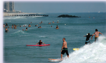
Prefer action on the water? Learn how to surf at Seven Presidents Oceanfront Park.

While most towns have local, neighborhood parks developed for recreation (think ball fields, playgrounds, and basketball courts), the state focuses on large, expansive tracts of land of state significance that remain largely undeveloped. The county does both.