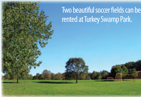
Two beautiful soccer fields can be rented at Turkey Swamp Park.

Beautifully maintained athletic fields are another way that county facilities serve the region—especially when the demand for local ball fields exceeds supply. There are 15 rentable ball fields in 3 different parks that offer extra space for school teams and intramural and community based sports leagues to practice and compete.