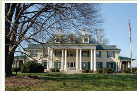
The Visitor Center, and beech 100 years later.