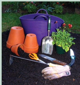
Nice to have (front to back): garden gloves, hand weeder, garden shears, garden knife, scoop, pruning saw, and tub trug.