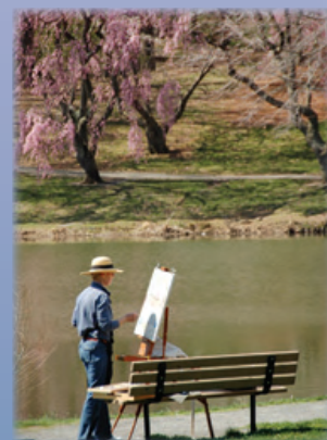
What better subject for a painting than Holmdel Park's spectacular cherry blossom display.