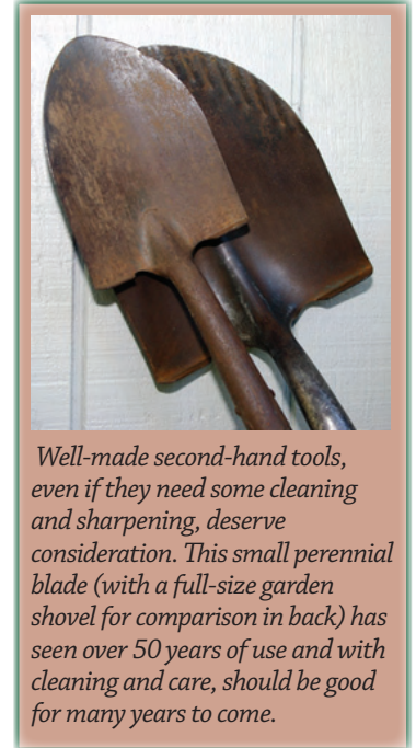
Well-made second-hand tools, even if they need some cleaning and sharpening, deserve consideration. This small perennial blade (with a full-size garden shovel for comparison in back) has seen over 50 years of use and with cleaning and care, should be good for many years to come.

Handle grips are important and often a matter of personal choice. Be sure that they fit your hand comfortably, are attached securely, and are substantial enough to stand up to use and time.