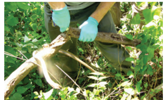
Treating an invasive kudzu vine in Hartshorne Woods.