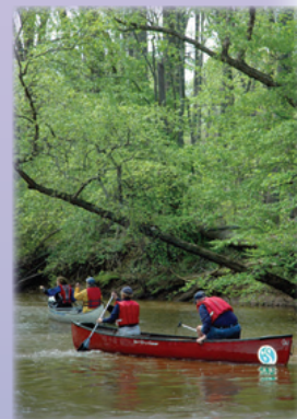
It's so nice to live near the water, where you can learn to kayak or canoe with park staff, then visit more than a dozen boat-friendly park sites... including the Manasquan River (pictured here).