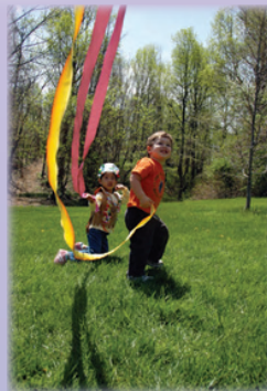
Dancing around the maypole has made a come-back at Deep Cut Gardens.