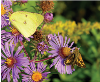
Native purple asters in the fields of Sunnyside Recreation Area, Lincroft, attract butterflies.

M onmouth County’s parks and precious open spaces are wonderful to look at and explore. Observing the many native plants and animals and feeling their calm and refreshing influence is a true pleasure. At the same time, these wonderful places require ever more vigilance to control the growing list of unwanted and damaging invasive plant species.