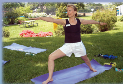
Take a deep, cleansing breath at an outdoor yoga class.