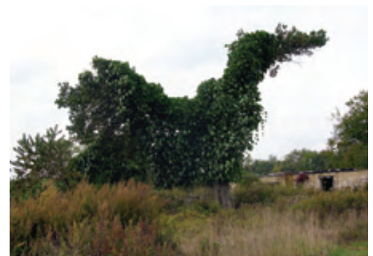
This kudzu vine formed an odd-looking “topiary” of sorts on a tree and telephone pole in Big Brook Park.

Two teams worked together to conduct a “cut and spray” treatment of the few acres of Kudzu vines identified in the park. Once treated, the vine is left to die in place and there is evidence of success from the first treatment. However, given the aggressive nature this plant, the Park System anticipates a 5-10 year treatment process.