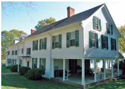
This porch (right) was part of an early 1900s expansion. The oldest sections are in the center of the house.

Portland Place is significant primarily for its well-preserved architecture, embodying several early building traditions in Monmouth County. Like many older buildings in the Park System, the main house was built in multiple sections over time with each representing a different period and method of construction. First was an early 1700s Dutch-frame cottage that is now the dining room in the middle of the house, followed by a large, two-story Georgian-style addition built in 1788.