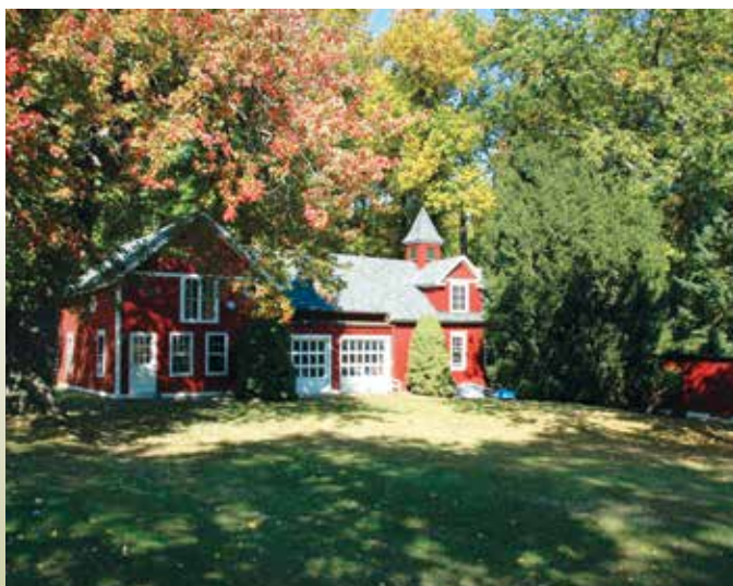
Portland Place also has this Carriage House near the road. Built in the early 1900s in the Craftsman/Colonial Revival Style, it was originally used to house the horses and carriages for residents and visitors, and was later converted into an apartment and storage.