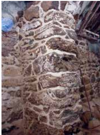
Some portions of the original stone foundation underneath the house needed re-pointing [that's when the crumbling old mortar is removed (left) and re-filled with new mortar (right)].