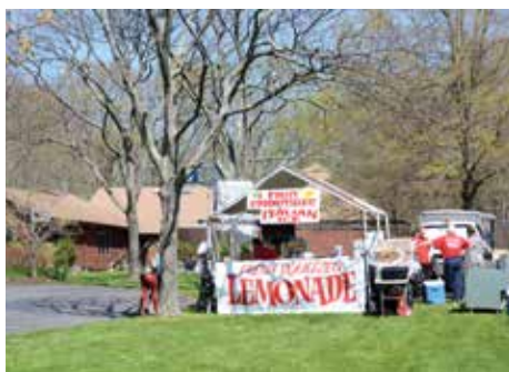
On April 27, Cultural Services sponsored the Park System's first Craft Show at Tatum Park . Held in conjunction with the Deep Cut Plant Swap across the street, it was hoped visitors could enjoy a double dose of park activities, with refreshments