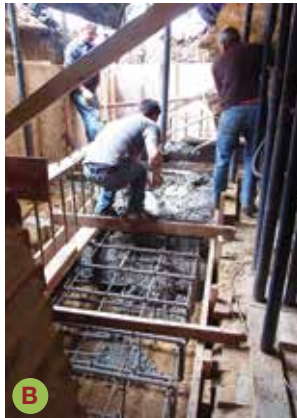
Other portions of foundation had to be removed altogether, and rebuilt from scratch. This kind of major structural work required temporary steel beams to support the south corner of the house while work got underway (A). The old foundation was replaced with this rebar-enforced, concrete footing (B) followed by a new concrete block wall (C). Note how the stone masons expertly 'joined' new wall to old. They also topped the new wall with salvaged old stones so no one would notice repairs from the outside.