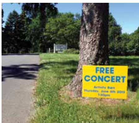
Concerts in the Parks. Visitors were invited to join us (bring a lawnchair or take advantage of inside seating) for a concert in the parks June 6 at 7:30pm in Thompson Park. The Colts Neck Community Band must have been a good idea, because about 160 people showed up to hear them!