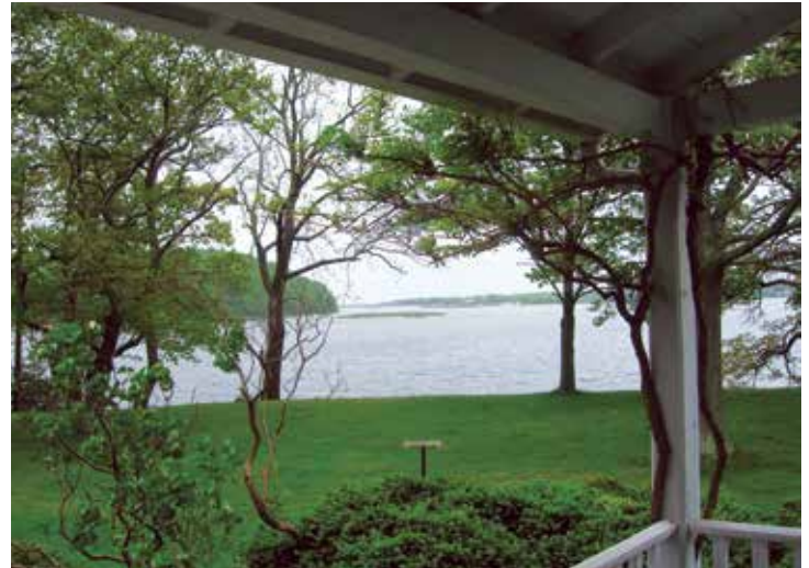
One photo just isn't enough to do justice the views of the Navesink from Portland Place. The lawn leads to the river (top), while sunlight and a passing fishing boat add to the mesmerizing view (right).

In addition to the honor and protections of the National Register, listing also helps ensure eligibility for historic preservation grants. Several million dollars of grant funding have helped to restore Historic Walnford, Longstreet Farm and the Bayshore Activity Center. In fact, Historic Walnford received the largest amount of grant money ever awarded by the NJ Historic Trust.