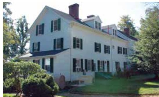
The front of the house at Portland Place faces the water (top). The back faces the street (left); that's the driveway in the foreground.