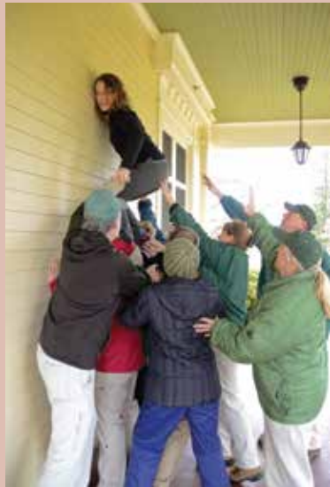
We're Climbing the Walls! Staff from Outdoor Adventures does a team-bonding exercise in March as part of their pre-season training that involves, quite literally, having one staffer scale the wall while others support the effort.