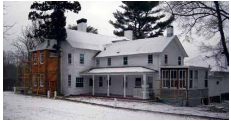
Exterior renovations kept the original architectural base structure while removing later additions such as an enclosed porch (right) and wings (left) features that weren't really serving any purpose.