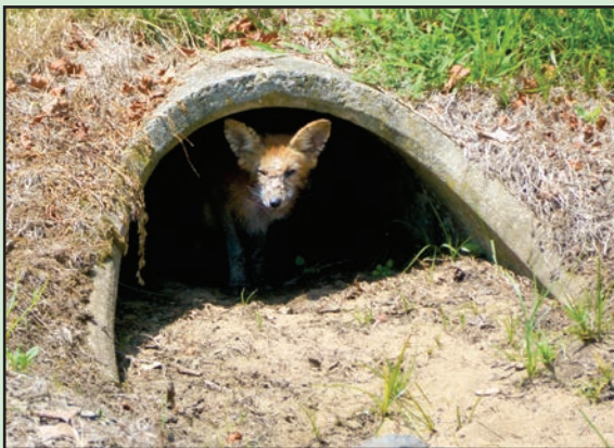
In a Foxhole. At Dorbrook, this drain doubles as a foxhole (though we aren't sure what happens when it rains)