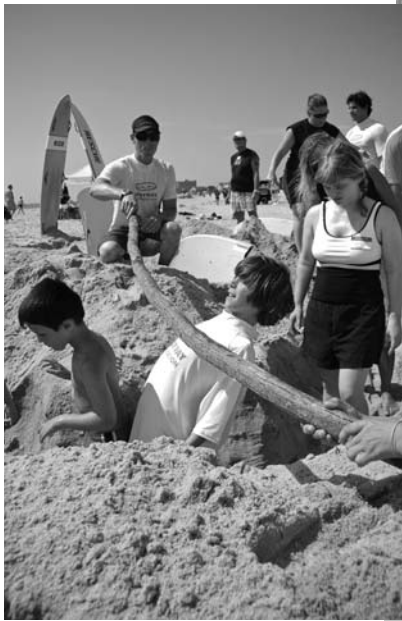
The Best Day organization held their first east coast event at Seven Presidents (by permit). It was a great success for area children with special needs.

On July 19th and 20th, Seven Presidents hosted two days of sand and surf activities for children with special needs. The event was designed to give the kids their “best day” ever at the beach, by making water sports and other activities more accessible. There were approximately 30 participants (and at least as many passionate volunteers) who enjoyed beach limbo, body boarding, surfing, kayaking, and a Coast Guard helicopter water rescue, where the “victim” was dressed as Spiderman.