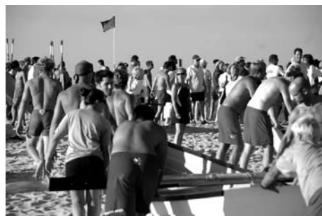
Spectators and participants line the shore for the 9th Annual Invitational Surf Relays.

On August 2nd, the team from Seven Presidents captured