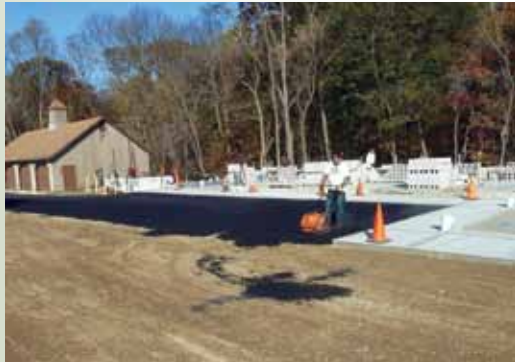
November 2011. Prepping the site, located next to the garage and gas tanks.