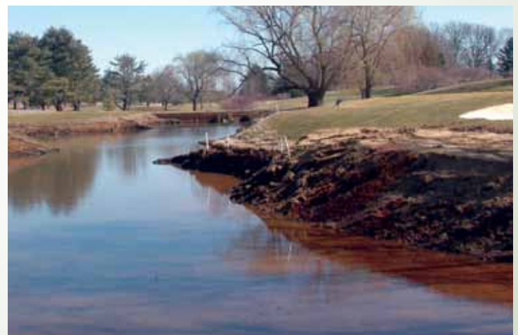
After: Now, you can see the pond filling up.