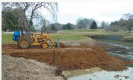
Larry builds a special access road into the pond.

Actual dredging of the pond was completed by the Monmouth County Mosquito Commission who sent over a 57 foot long-reach excavator with an operator to scoop out years of silt, golf balls and who knows what else from this large water feature.