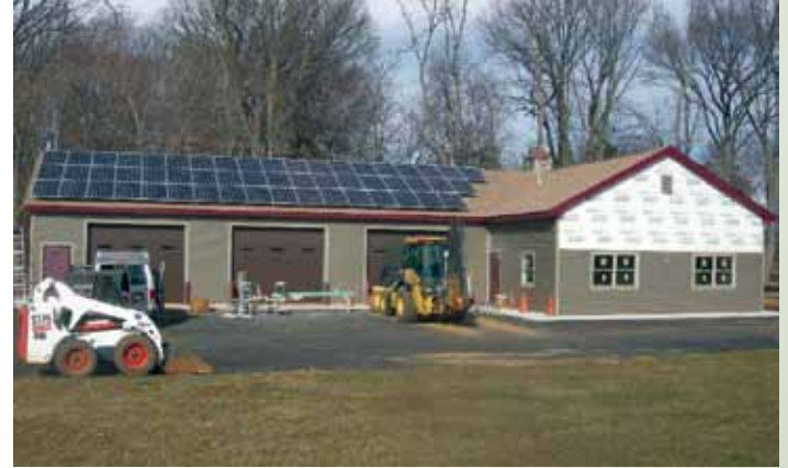
By February, our fifth set of solar panels were installed. As of late March, the building was nearly complete.