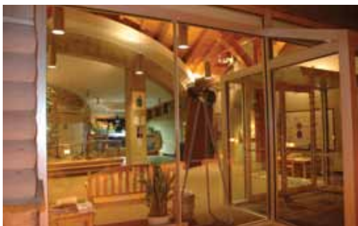
Doesn't the MREC lobby look different at night?!