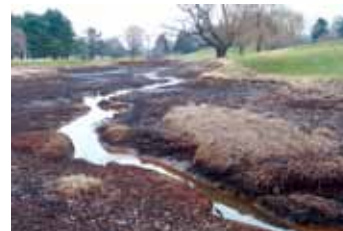
Before: Water drained, it is obvious this pond could use some help.

Before, during and after photos show transformation of this water body from an almost marsh-like state to a nice, clear pond. By the way, since dredge spoils cannot be shipped off-site they were taken to no-mow areas, and were also used to create new visual features (mounds) on others parts of the course.