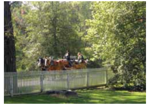
The couple arrived via horse-drawn wagon.