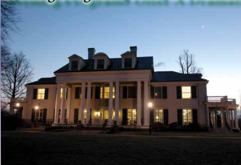
The Visitor Center looks even more grand at night.

The first programs under the 2012 theme, "Let's Meet Under the Stars," began this past winter. So far, photos taken during these programs—held for the first time at night—have yielded unique and beautiful images that hopefully parallel the new experiences had by our visitors.