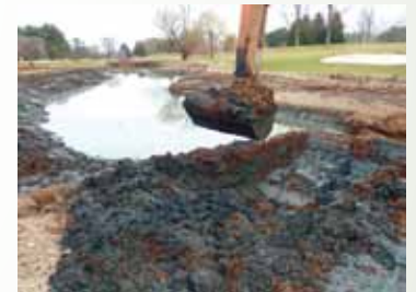
During: The process went like clockwork, taking about a month while the course was closed for winter.