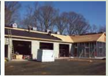
December, building is well underway