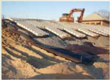
Concrete mats stabilize the dunes at Bayshore.

To repair repeated storm damage that eroded the beach at the Bayshore , the Park System undertook a dune restoration project in early 2012 to, well...shore up the shoreline. Part of this project involves affixing these unusual looking concrete mats to stabilize the dunes.