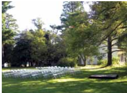
The wedding ceremony took place alongside the Waln House, facing the mill and the creek.