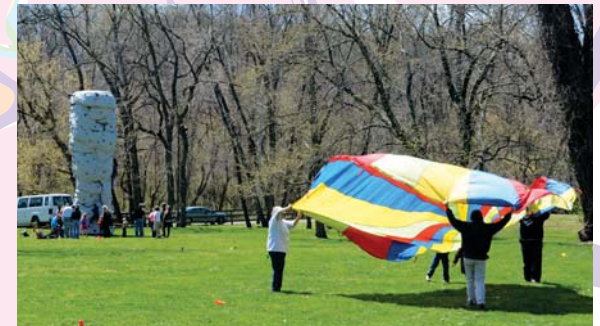
Then, the parachute moved on to celebrate spring at Walnford's Bluebell Festival , alongside a dozen more activities such as the climbing wall (also pictured), Frisbee golf, old-fashioned games and music—enjoyed by adults and children.