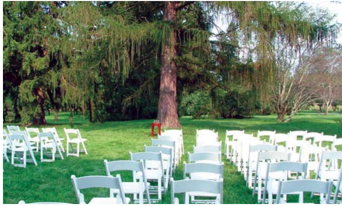
There is no more beautiful backdrop against wedding white than the lush green Visitor Center lawn at Thompson Park. This wedding ceremony occurred outside, but the wedding party also took advantage of the beautiful Visitor Center for preparation.