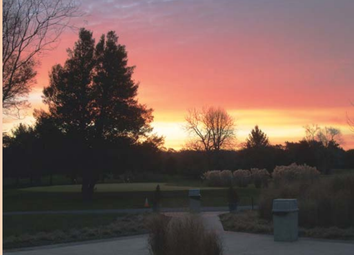
Sunset over Shark River GC