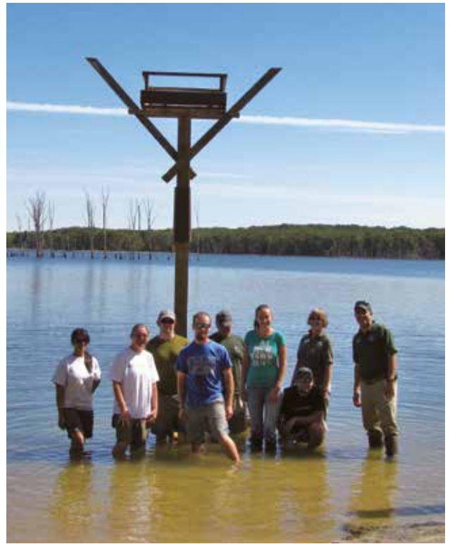
With generous support from the Monmouth County Audubon, park staff and volunteers from New Jersey's Conserve Wildlife Foundation installed this new platform in September. Now it is up to the osprey...

Naturalists hoped it was just the normal ebb and flow of life, but were saddened to observe that when veteran adult osprey died, they were replaced by much less practiced pairs who found building on the increasingly fragile, dead trees a nearly impossible challenge. They would build their nest, only to have the first spring storm destroy it before they even finished. Male ospreys are masterful nest builders, and have used both the site's dead-trees and a wooden tree stand (built behind the dam 6-7 years ago). But, for the past two years in 2011 and 2012, the osprey visited, but didn't stay. For first time in 20 years, there were no nesting pairs. Naturalists are hoping a new platform may help here as it has in other park sites.