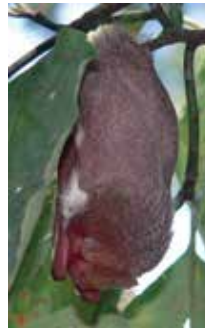
Eastern Red Bat