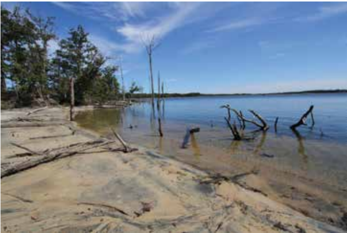
Staff know the increasingly fragile shoreline trees at the Reservoir were expected to die off over time.

According to Naturalist Chris Lanza, ever since the park first opened in 1990, Osprey have been a big part of the seasonal rhythm, coming in early March (around St. Patrick's Day) and leaving in late August or September. Before the bald eagles arrived in 2001, the osprey and their nests were the main attraction of public boat tours. Staff could normally count on 5-6 nests per season, but slowly this number has dropped off.