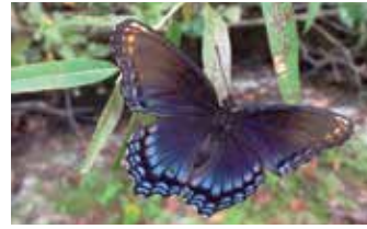
Red-spotted Purple Butterfly

Pretty Smart, For an Insect. The beautiful Red-spotted Purple Butterfly mimics the size and coloring of the poisonous Pipevine Swallowtail to deter predators, such as birds. The Pipevine is poisonous because it feeds on toxic plants of the pipevine family, for which it is named. Other butterflies also mimic the Pipevine Swallowtail, including the eastern tiger swallowtail, black swallowtail and spicebush swallowtail.