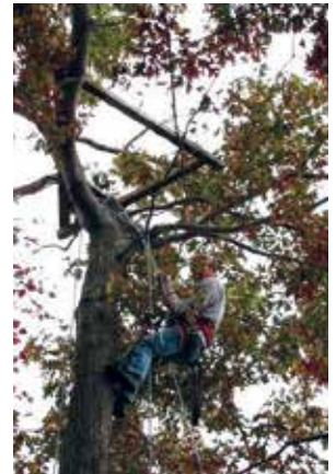
This photo shows the original nest and the state biologist installing the new platform at a distance below. The existing nest can not be removed without a federal permit.