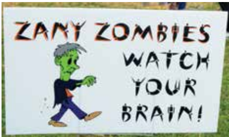
Also new at Thompson Park Day, a zombie treasure hunt since—as you may have noticed—zombies (along with vampires, hobbits and other fantasy creatures) are very popular at the moment.