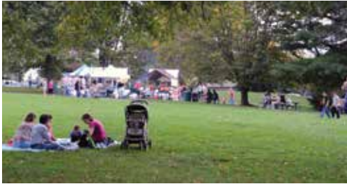
The Harvest Home Festival now has food vendors; an addition that visitors really seemed to enjoy! This event attracted 7,840 attendees this year, a new record!