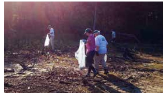
Volunteers held their first-ever clean-up at the Manasquan Reservoir this past September. After 20 years of recreational use, staff began to notice some debris on the shoreline when the water level was lowest—usually near summer’s end. Volunteers navigated the challenging terrain like true professionals, slogging through mud and muck, and over tree stumps and roots to gather the litter.