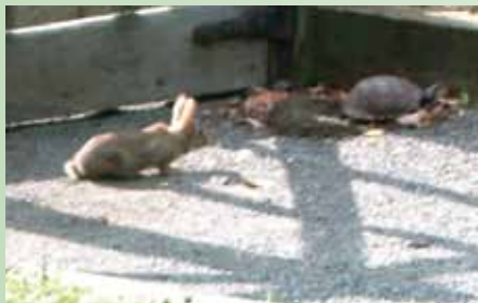
A bunny shows its curious side, tentatively approaching the nest, perhaps to challenge the turtle to a race.

Squirrel Moves Into Owl Nest. Last fall, this Southern Flying Squirrel took up residence in an owl nesting box at Huber Woods. Abundant throughout the state, you might not be familiar with this creature since it is mostly active at night (notice the exceptionally large, dark eyes). Flying squirrels do not really “fly” but use