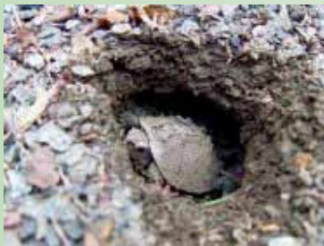
The first offspring began emerging on September 14.