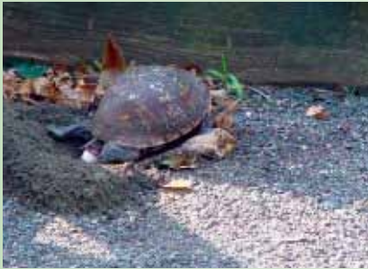
The mother digs her nest June 29 and begins laying eggs, 8 in total, which she covered with dirt and some leaves for camouflage. She hid the nest so well, you couldn't even tell the ground had been disturbed!

The Turtle, the Humans, and the Hare. This charming series of photos shows how Deep Cut staff helped this Eastern Box Turtle survive her unfortunate choice of nest site.