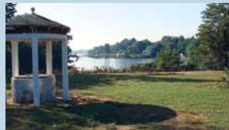
The newly opened Claypit Creek Area at Hartshorne Woods Park now hosts visitors using the site to walk their dogs, go birding and eat lunch on the picnic tables.

The first two miles of the Union Transportation Trail in Upper Freehold opened on September 25. The event's 75 attendees included park staff, Freeholders, Recreation Commissioners and local residents who all hit the trail together to ride horses, bicycles, or just take a stroll.