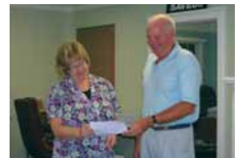
In the newly renovated A&D building, Thompson Park 2010.