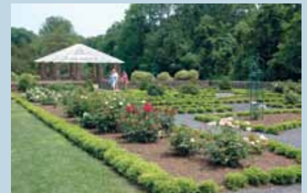
There's a new white (historically accurate) roof on the pergola at Deep Cut Gardens.