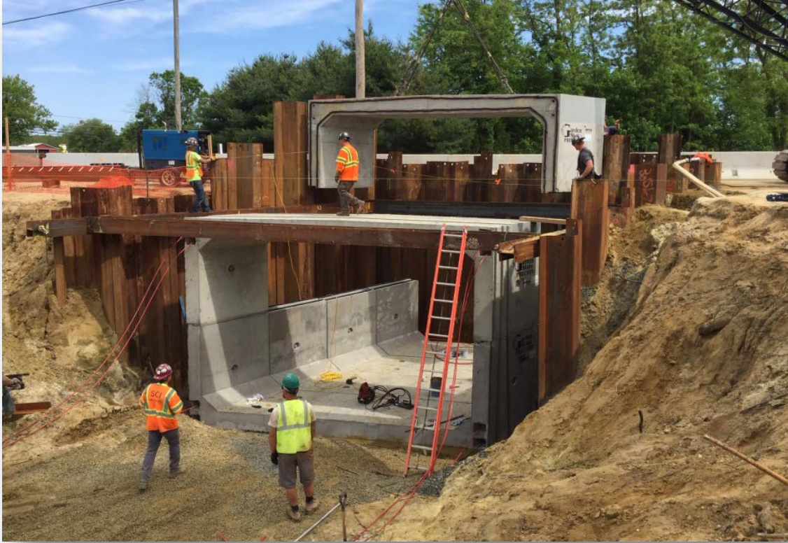
Construction in progress (above) and completed (below)