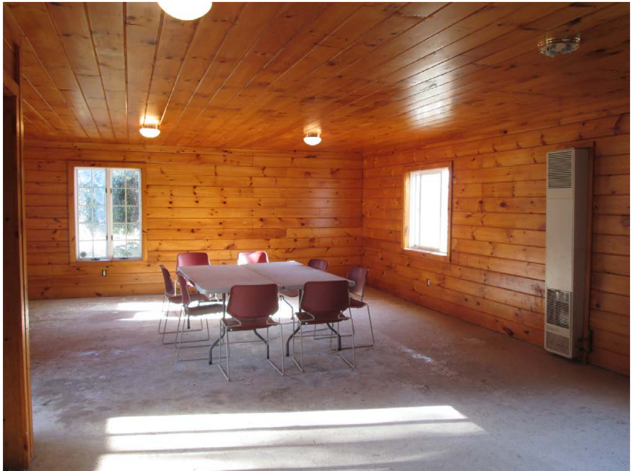
Former tack room to be converted to programming space