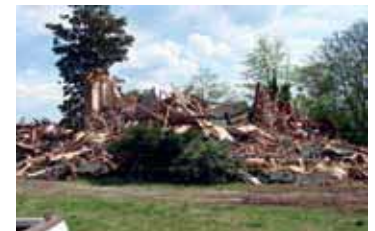
A pile of rubble.