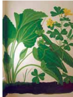
A Praying Mantis amidst a tuft of Wood Sorrel.