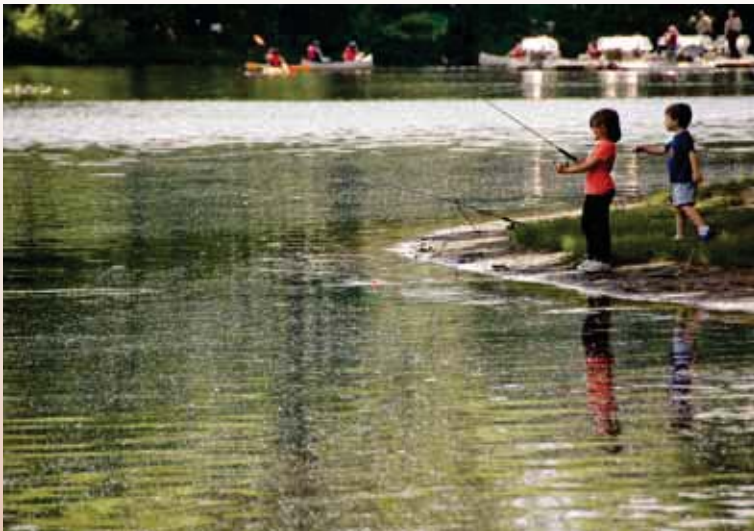
Children enjoy the fishing derby at Outdoor Expo this past spring.