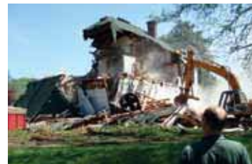
Halfway through demolition.