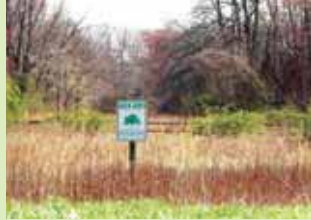
The Yellow Brook Tract is an undeveloped piece of property off of Rt. 33 in Howell.

Our fifth decade began with the purchase of land for the Metedeconk River Greenway, preservation of the Yellow Brook Tract, and opening of the Manasquan Reservoir Environmental Center.