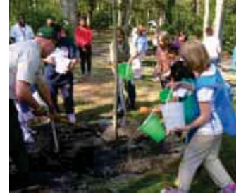
The children give the tree its first dose of water.