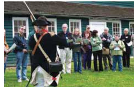
The onlookers are from historical societies and sites interested in presenting living history programs, as well as members of the New Jersey Living History Advisory Council.

KA-BOOM! Normally one of our quieter sites, Historic Walnford hosted a noisier-than-normal workshop this past spring, entitled “Presenting the Past,” sponsored by the NJ Living History Council (NJLHC). During that event, attendees saw a demonstration on black powder safety procedures for living history programs.