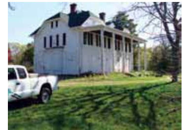
A close-up of the house.