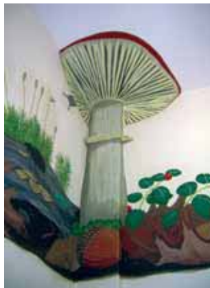
That's a wood mushroom in the corner, with a common black ground beetle.