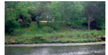
View from bridge (after demolition).