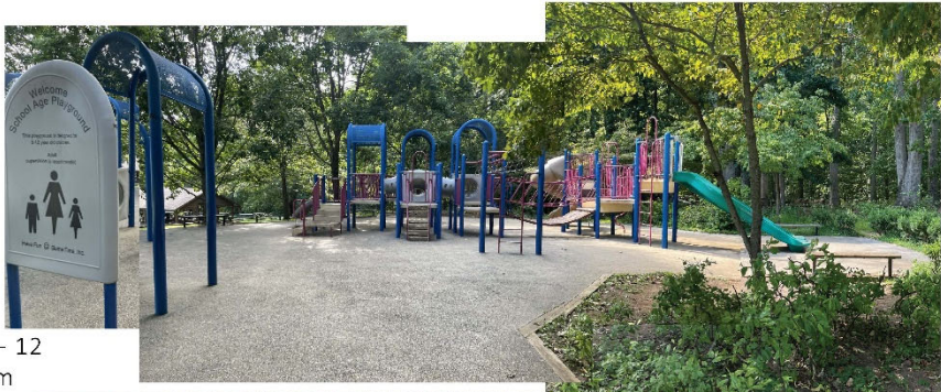
Facing the 5 – 12 Play Area from the Hub