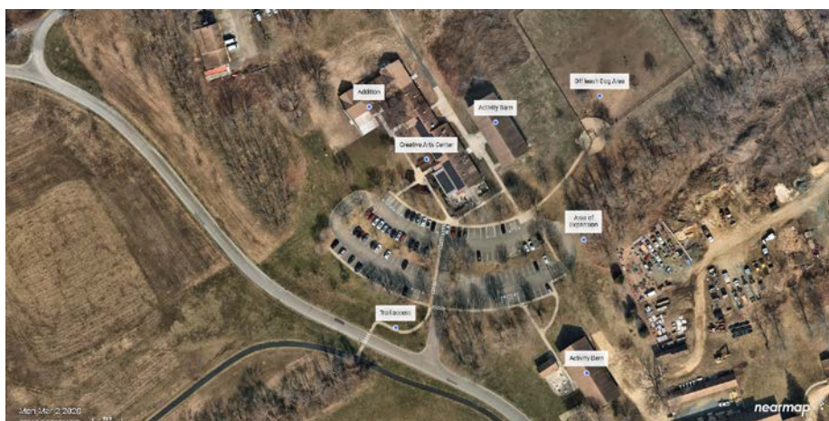
Existing Parking Area