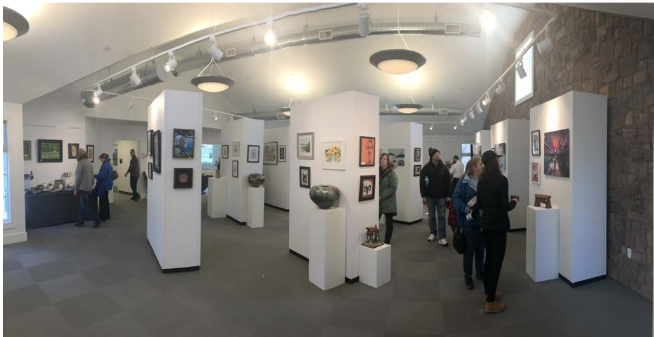
2 New Gallery in the Creative Arts Center