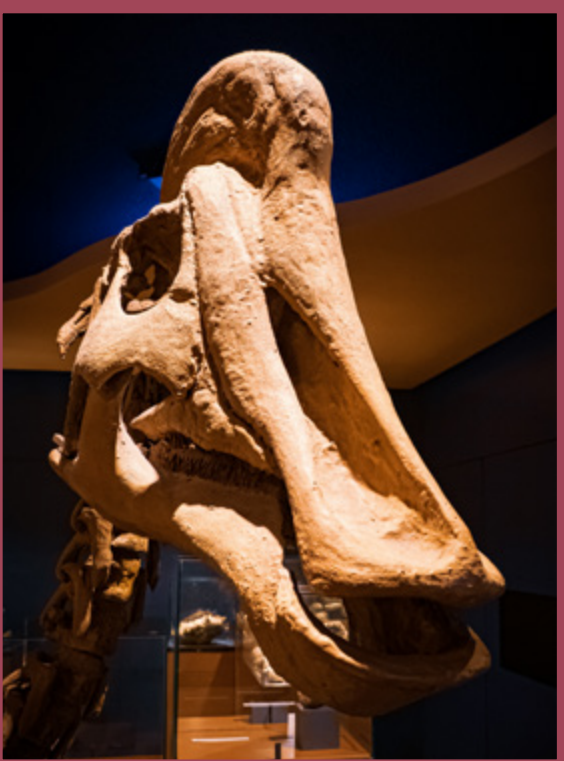
Photo: Hadrosaur Dinosaur Fossil I

Deer management will take place at some of the parks during the months of October, November and December. Please visit our website for updated information on locations and times.