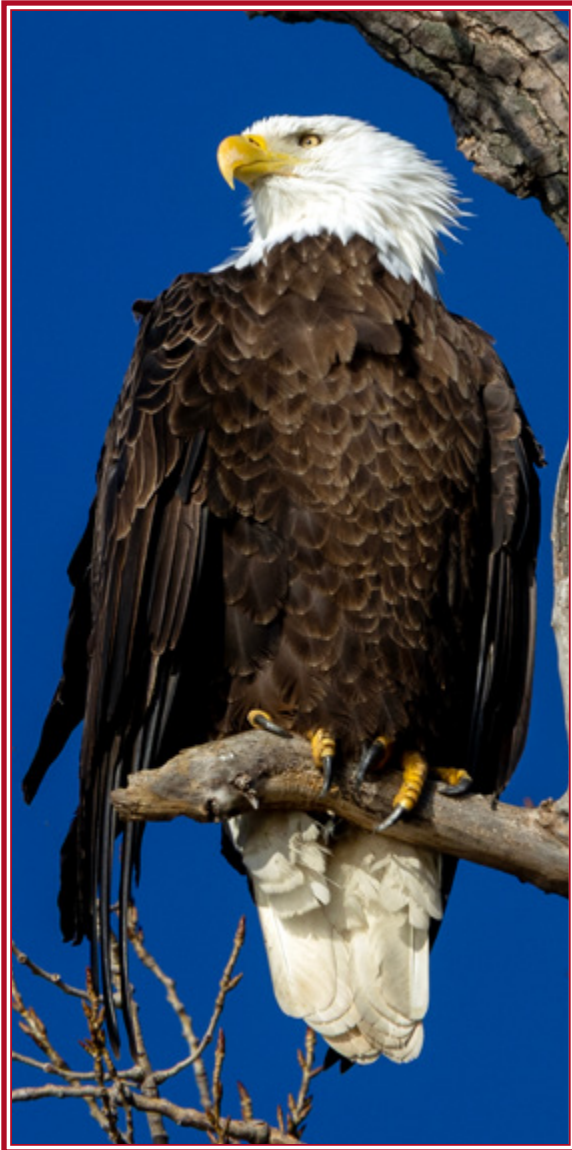
Photo: Bald Eagle

Deer management will take place at some of the parks during the months of October, November, and December. Please visit our website for updated information on locations and times.