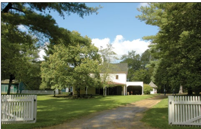
Carriage House, Today

2 The 1879 Carriage House was built for the Walns' carriages and the horses that pulled them. Look up to see the running stag weathervane.