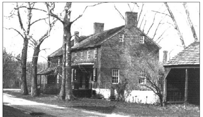
Tenant Houses, 1960s

9 Two 18 th Century Tenant Houses were located here until 1969 when they were destroyed by arson.