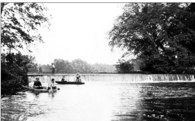
Mill Pond, 1890s

4 The Caretaker's Cottage was added to the rear of the house in 1910-12. The White Pine trees separating the house and farm were planted around the same time. Now the building serves as offices for park staff.