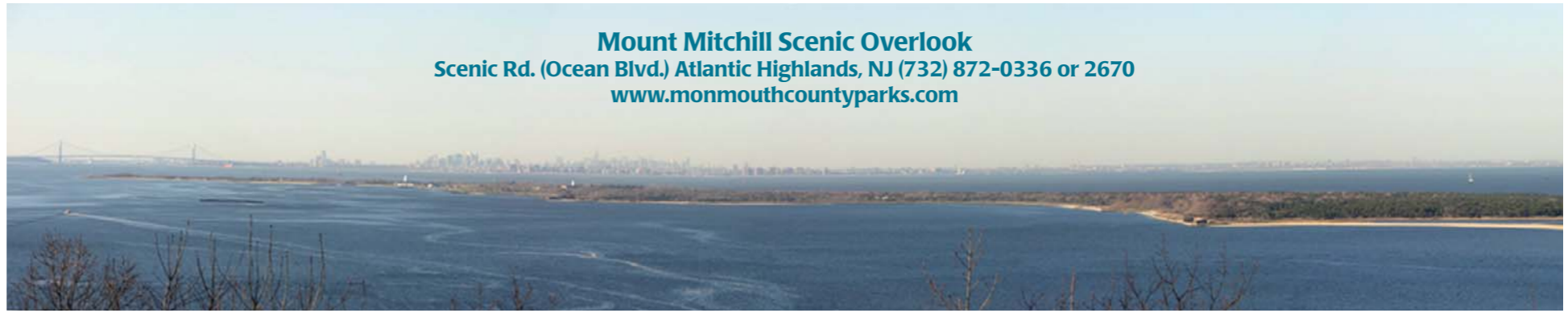
Mount Mitchell Scenic Overlook Scenic Rd. (Ocean Blvd.) Atlantic Highlands, NJ (732) 872-0336 or 2670 www.monmouthcountyparks.com

③ Finally, visitors enter "the light" by approaching a plaza rimmed with a mix of perennials and grasses. Seven birch trees around the plaza symbolize the four planes and three buildings involved in the 9/11 tragedy.