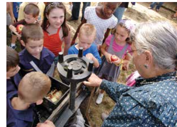
Making cider at Harvest Home Festival

Donations of time, equipment and funds continue to make Longstreet Farm a special part of local history. Volunteers may work alongside staff in a variety of ways. If you are interested in becoming a volunteer, please talk to one of the staff, or contact the Park System Volunteer Office online or at (732) 842-4000, ext. 4283.