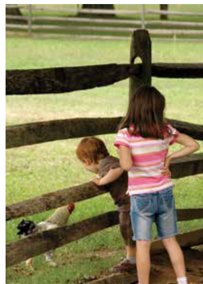
Visitors can observe horses, mules, dairy cows, chickens and pigs.

As a site dedicated to accurate historic representation of a working farm in the 1890s, the animals at Longstreet provide labor, food, and other resources—just as they did in the past. These are not pets, but rather working animals that show how local residents relied on them. Horses and mules plow the fields and are used for transportation; dairy cows provide milk; and chickens, pigs and sheep are kept for their meat as well as eggs, lard and wool, respectively.