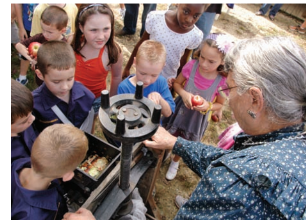
Making cider at Harvest Home Festival

Donations of time, equipment and funds continue to make Longstreet Farm a special part of local history. Volunteers may work alongside staff in a variety of ways. If you are interested in becoming a volunteer, please talk to one of the staff, or contact the Park System Volunteer Office online or at (732) 842-4000, ext. 4283.