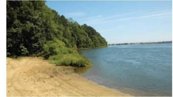
Black Fish Cove

The New Jersey Saltwater Angler Registry now requires all anglers 16 and up to register online (for free) to fish in marine and fresh tidal waters of NJ. Visit www.saltwaterregistry.nj.gov .