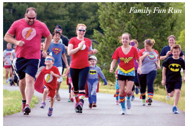
Family Fun Run

Bicyclists, in-line skaters and skateboarders under age 17 are required to wear a helmet.