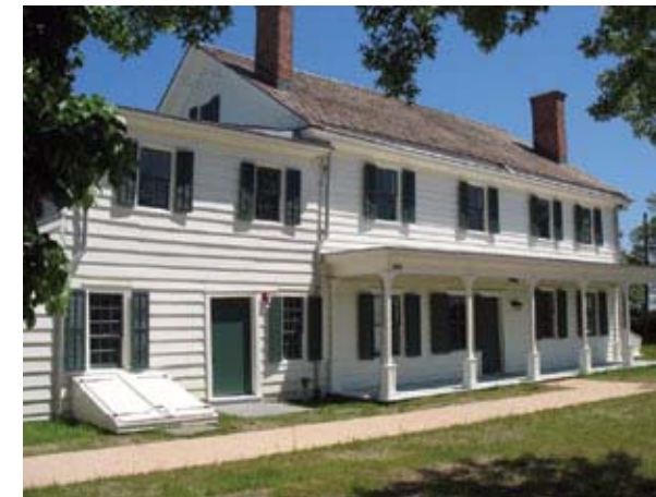
Bayshore Activity Center

Bayshore Waterfront Park was acquired by Monmouth County in 1988. In 1998 the Bayshore Activity Center was acquired from Middletown Township as a park addition. It is one of the oldest surviving houses in the Bayshore region with ties to the area's settlement, as well as maritime history. The oldest section of this large frame house dates back to the early 1700s, with multiple additions built by the Seabrook and Wilson families between the 1700s and 1800s. The waterfront setting of this valued community landmark gives way to views of the New York City skyline and Raritan/Sandy Hook Bay.