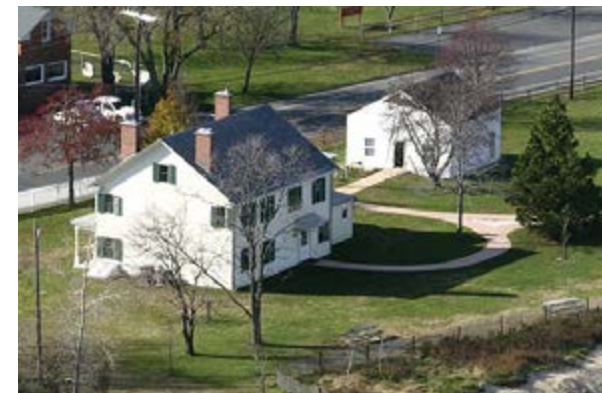
Bayshore Activity Center (left) and Activity Shed (right)

Bayshore Waterfront Park was acquired by Monmouth County in 1988. In 1998 the Bayshore Activity Center was acquired from Middletown Township as a park addition. It is one of the oldest surviving houses in the Bayshore region with ties to the area's settlement, as well as maritime history. The oldest section of this large frame house dates back to the early 1700s, with multiple additions built by the Seabrook and Wilson families between the 1700s and 1800s. The waterfront setting of this valued community landmark gives way to views of the New York City skyline and Raritan/Sandy Hook Bay.