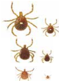
Amblyomma americanum (Lone Star Tick)