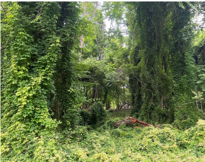
Initial site conditions: chocolate vine smothering tall trees.

Invasive species are plants and animals that are non-native to an ecosystem and whose introduction causes environmental harm. Invasive plant species degrade native ecosystems by outcompeting native plants for resources such as habitat, water, nutrients and light. Native plants are important to an ecosystem because native animals depend on them for survival. In the case of chocolate vine, this invasive species is a climbing vine that can topple large trees if left unmanaged. Additionally, chocolate vine spreads quickly and creates dense mats of vegetation that cover and prevent the growth of native vegetation. After removal of the invasive species, native plants and animals can be restored to the area to protect and improve forest health.