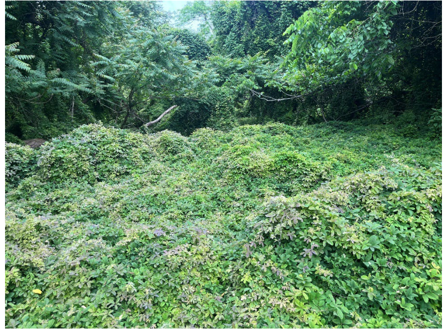
Initial site conditions: chocolate vine blanketing understory

The Monmouth County Park System is working to remove an emerging invasive species called chocolate vine ( Akebia quinata ) which has spread across 27 acres of the Claypit Creek section of Hartshorne Woods Park. In 2019, the NJ Invasive Species Strike Team (NJISST) diagnosed this area with “Infested Forest Syndrome” which is a forest clogged with invasive species and lacking native understory species. In order to prevent the invasive vine from further damaging forest health and to restore healthy habitat conditions, stewardship is required. Efforts began in July 2023 when volunteers with the Monmouth County Invasive Plant Strike Force removed several acres of chocolate vine by hand to preserve significant areas of the forest. Future work will include additional mechanical removal and herbicide applications with a temporary blue dye so that park staff can track treatment progress. This process will be repeated over several years. Once the invasive vine is under control, native trees and shrubs can be planted to return the forest to a healthy condition and improve wildlife habitat.