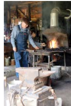
Wood stove cooking and blacksmithing demonstrations.