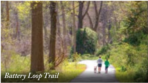
Battery Loop Trail

NOTE: At a brisk pace, it takes approximately 20 minutes to walk 1 mile (1.6 km).