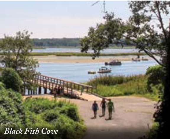
Black Fish Cove

Anglers can cast for striped bass, fluke and flounder in the Navesink River from the pier or shoreline at Black Fish Cove (a steep, 0.2 mile walk from the Rocky Point parking lot). All anglers age 16 and up must register online (for free) to fish in marine and fresh tidal waters of NJ. www.saltwaterregistry.nj.gov .