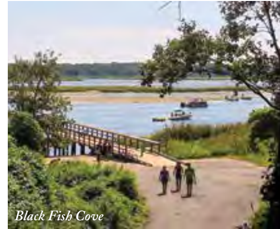
Black Fish Cove

Anglers can cast for striped bass, fluke and flounder in the Navesink River from the pier or shoreline at Black Fish Cove (a steep, 0.2 mile walk from the Rocky Point parking lot). All anglers age 16 and up must register online (for free) to fish in marine and fresh tidal waters of NJ. www.saltwaterregistry.nj.gov .