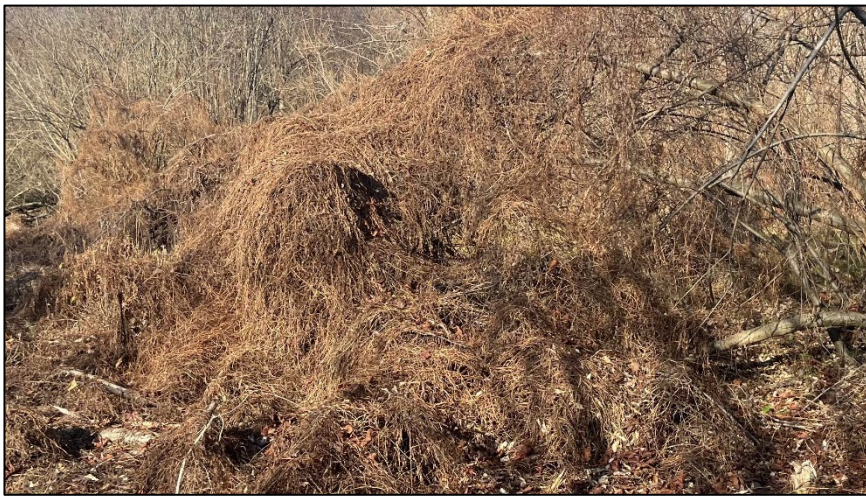
Before: Invasive olive and Callery pear smothered in invasive vines

The Monmouth County Park System is working to remove invasive species in Big Brook Park. This area was heavily infested with detrimental invasive species called autumn olive ( Elaeagnus umbellata ) and Callery pear ( Pyrus calleryana ). Big Brook Park has been identified as a regionally critical area for grassland birds. To preserve this integral habitat and the food sources our sensitive native wildlife requires, stewardship is necessary to restore healthy habitat conditions. Selective land clearing took place on a 7.5-acre portion of Big Brook Park in early 2024. Native grasses were seeded into the cleared areas and herbicide applications were selectively applied to control any regrowth of the invasives. This process will be repeated over many years.