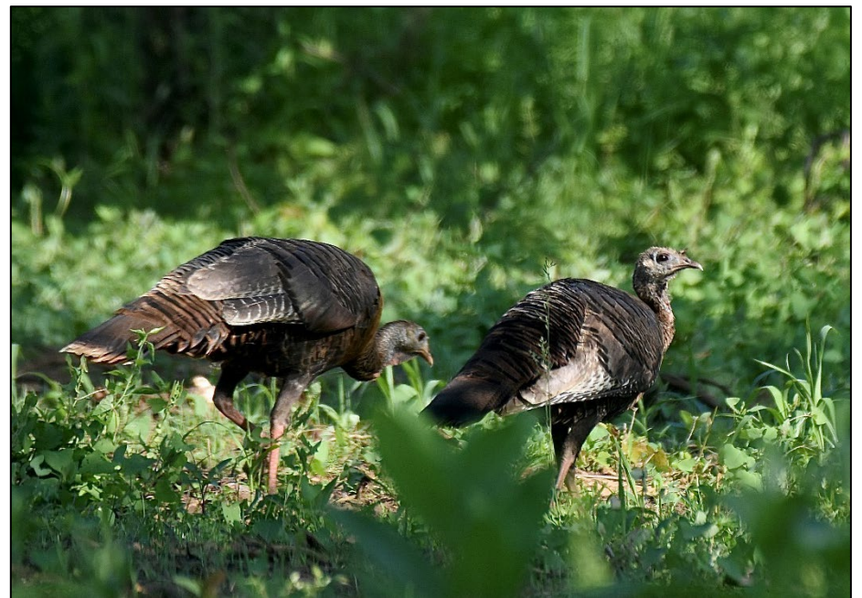
With the invasive species removed and native plants establishing, many wildlife species were recorded returning to the site by summer 2024 from breeding bluebirds to the wild turkey pictured here.

Invasive species are plants and animals that are non-native to an ecosystem and whose introduction causes environmental harm. Invasive plant species degrade native ecosystems by outcompeting native plants for resources such as habitat, water, nutrients, and light. Native plants are important to an ecosystem because native animals depend on them for survival. In the case of autumn olive and Callery pear, these invasive species are fast growing woody plants that quickly outgrow and shade native species. While the successional growth of native trees and shrubs is a natural process, these invasive species begin to dominate the landscape and do not provide resources that native pollinators and other native wildlife require. After removal of the invasive species, native plants and animals can be restored to the area to protect and improve field and forest health.