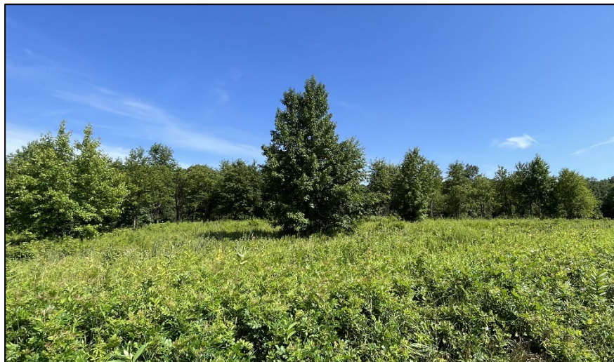
After: Open field with a diversity of native flowers and grasses